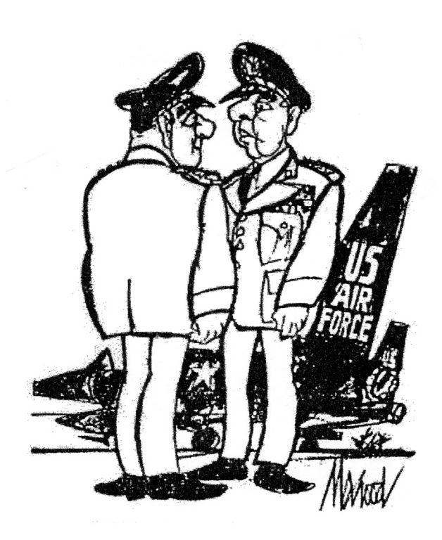
"I can't see the objection to spraying people with napalm if it makes the world a better place to live in."