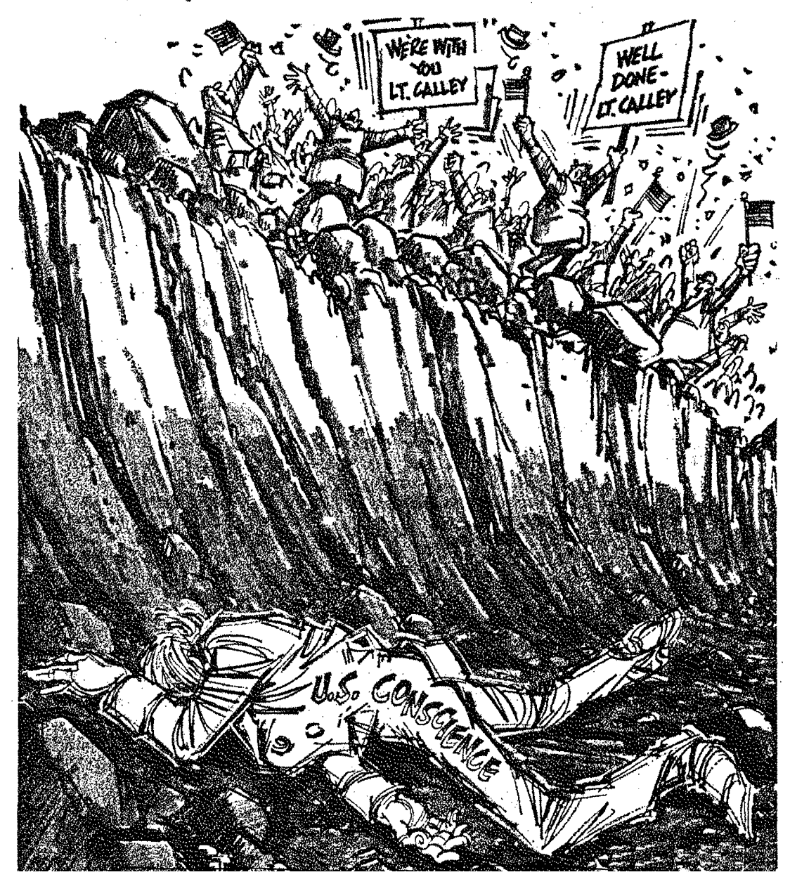
A cartoon published in an American newspaper in May 1971.