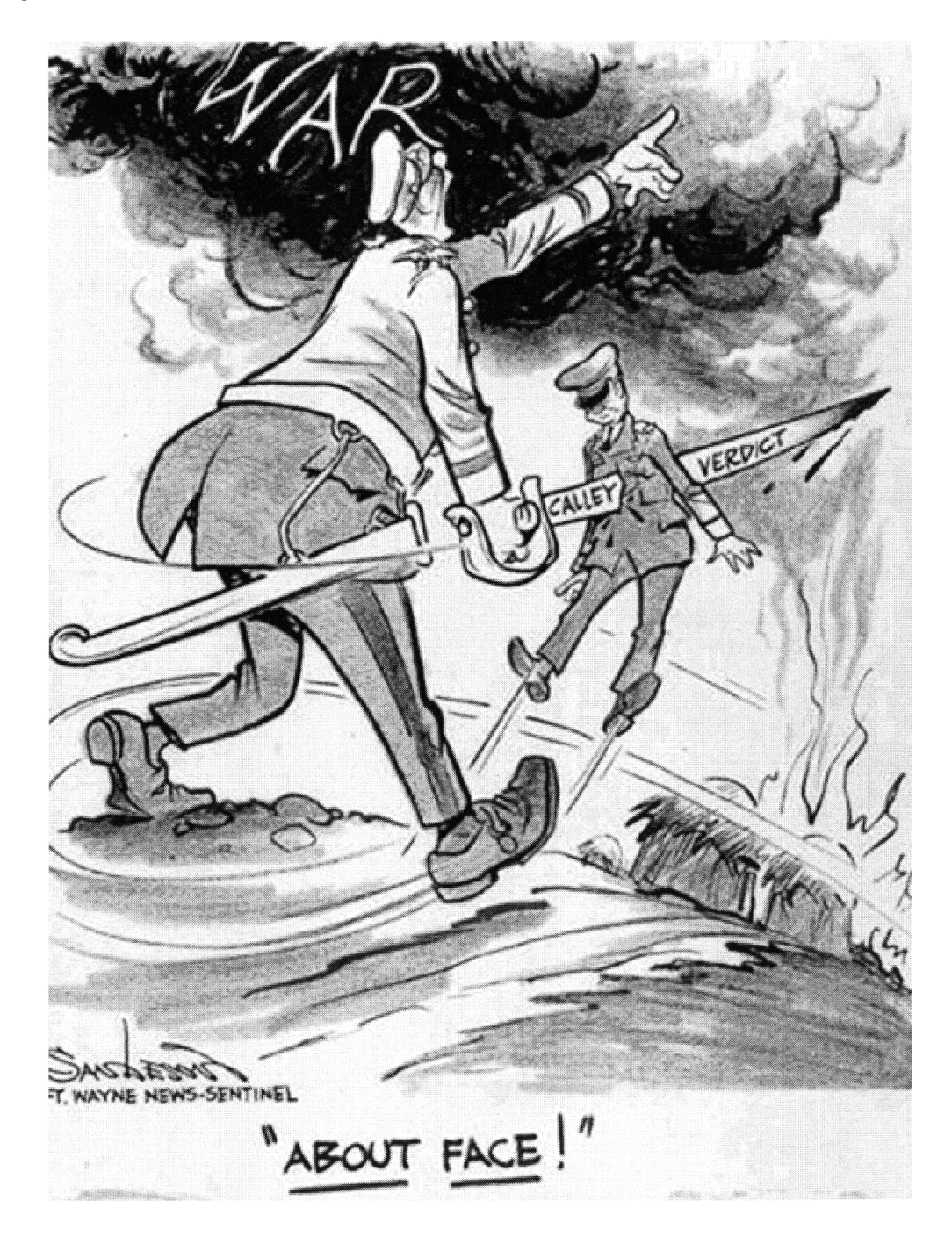
A cartoon published in an American newspaper in 1971. The soldier carrying the sword is a general.