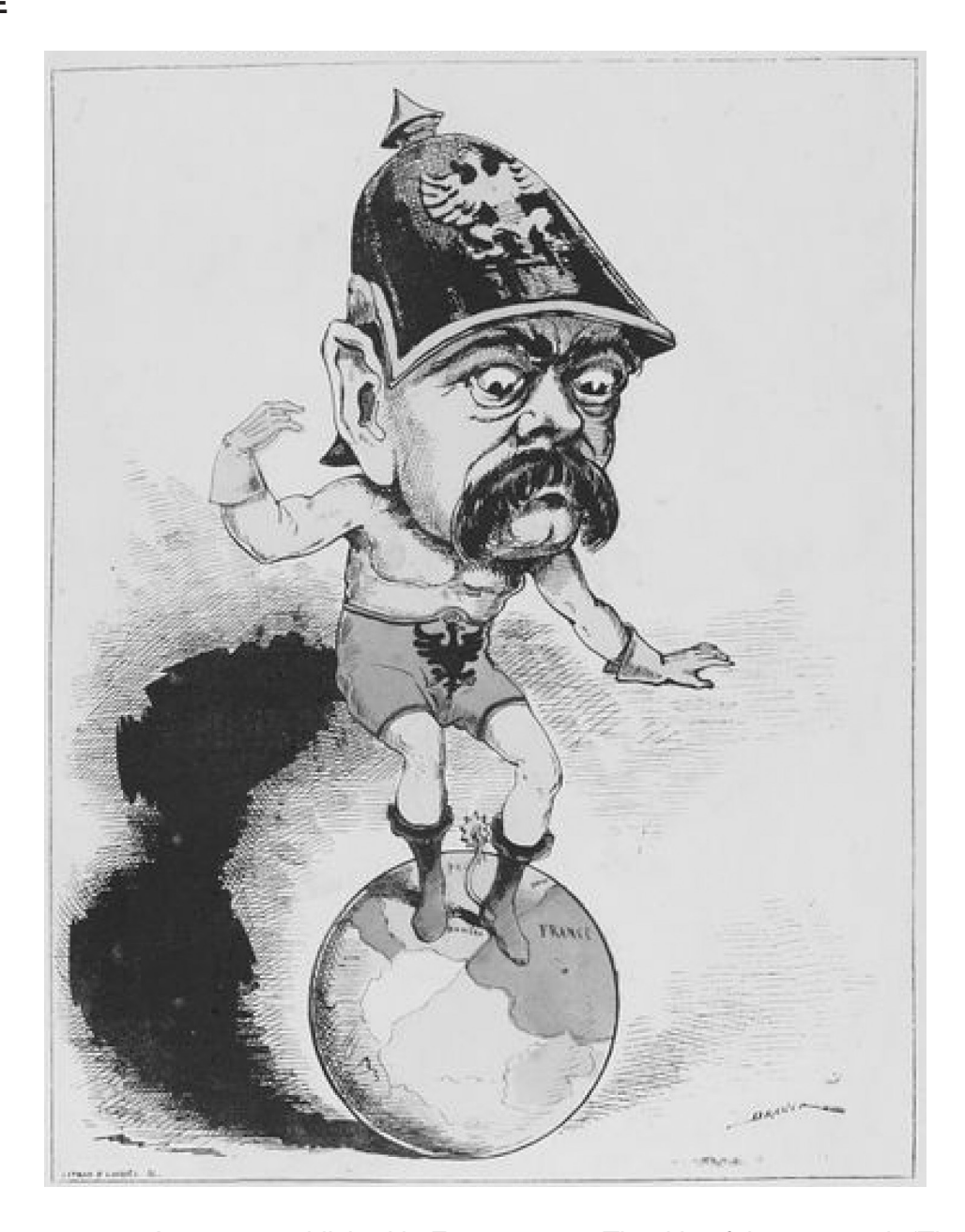
A cartoon published in France, 1870. The title of the cartoon is 'The Man on the Ball'. Bismarck's left foot is on France.