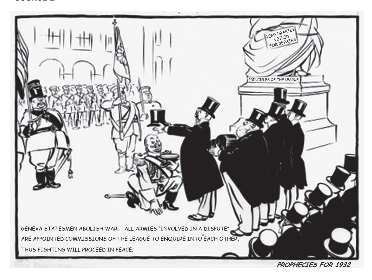
A British cartoon published in December 1931.