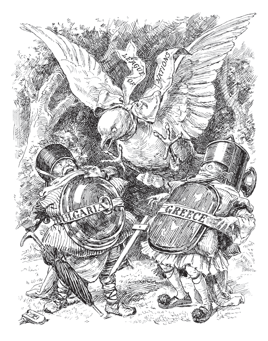
"JUST THEN CAME DOWN A MONSTROUS DOVE WHOSE FORCE WAS PURELY MORAL, WHICH TURNED THE HEROES' HEARTS TO LOVE AND MADE THEM DROP THEIR QUARREL."

A British cartoon published in November 1925.