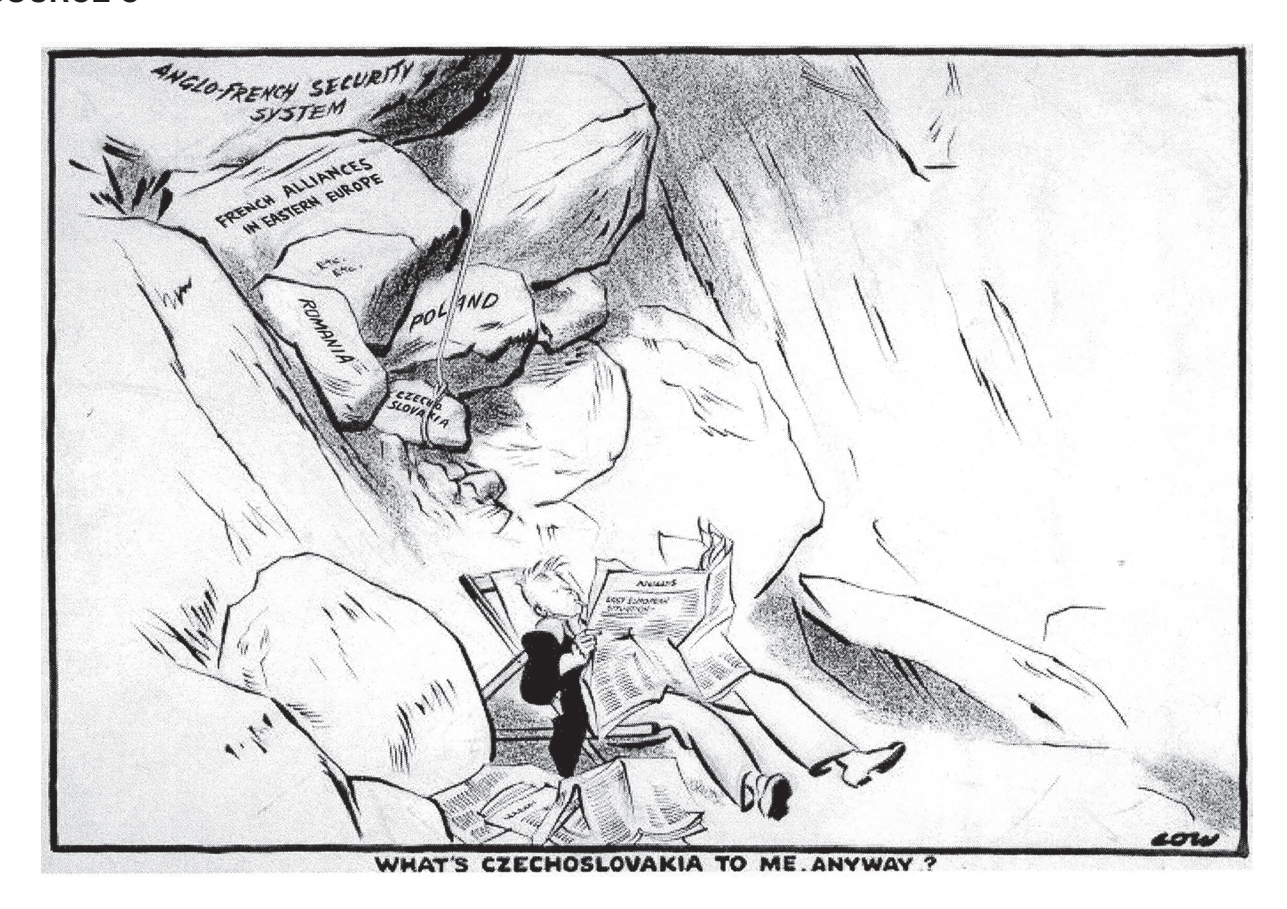
A British cartoon published in July 1938.