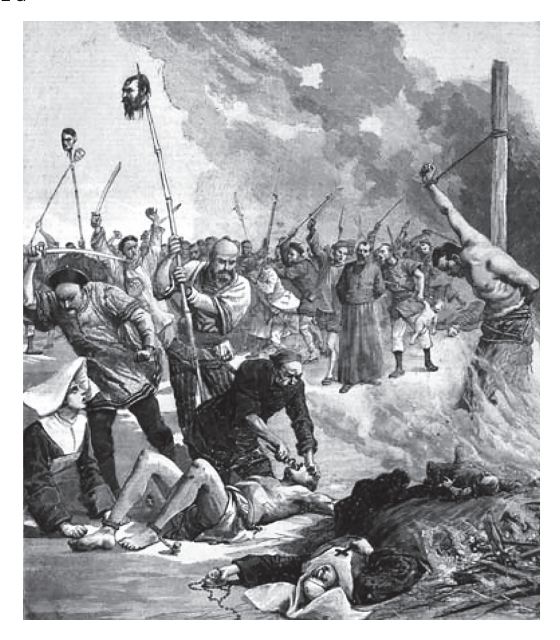
A European drawing from the time showing what happened to some Christians during the Boxer Rebellion.