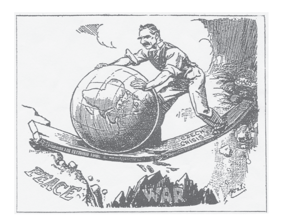
A British cartoon published on 25 September 1938.