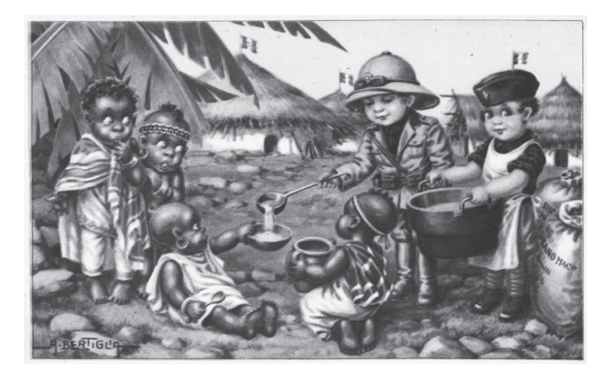
A postcard published in Italy in 1936 showing Italian and Abyssinian children in Abyssinia.