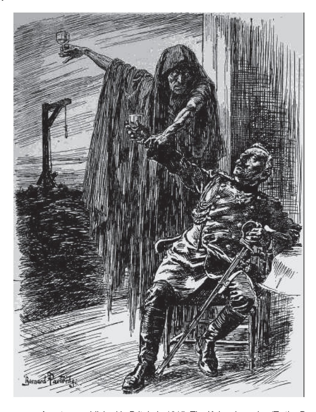
A cartoon published in Britain in 1915. The Kaiser is saying 'To the Day...', but the figure of Death adds the words '...of reckoning!'