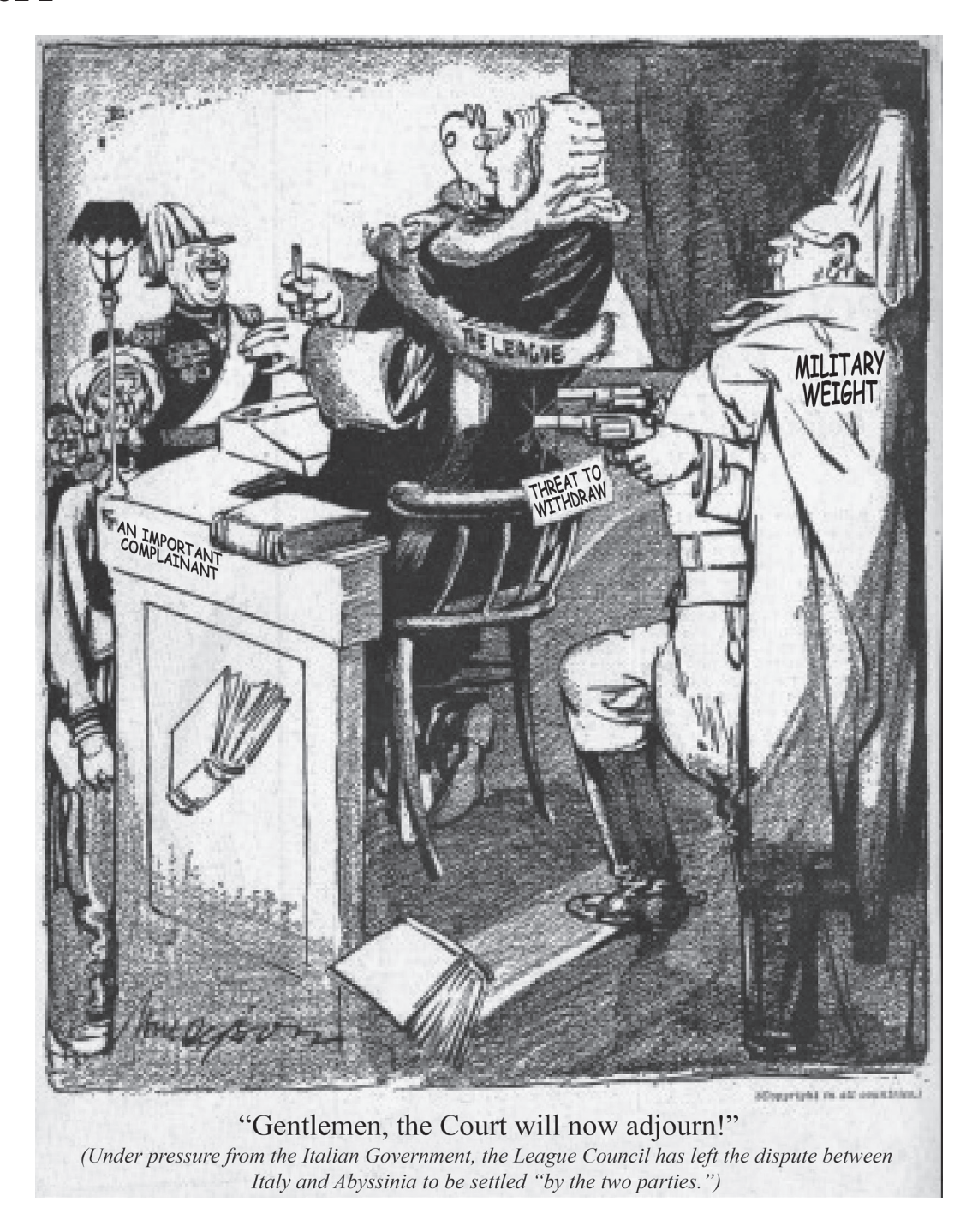
A cartoon published in an English newspaper, 1936.