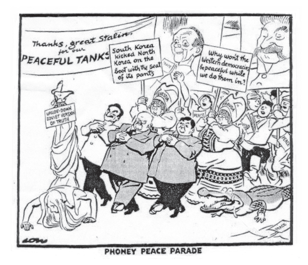
A cartoon entitled 'Phoney Peace Parade' published in Britain, 4 July 1950. Britain had asked the Soviets to help bring about a peaceful settlement and they promptly mounted a 'peace' campaign.