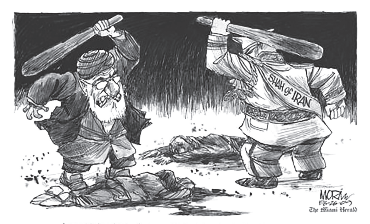
MEET THE NEW BOSS "SAME AS THE OLD BOSS "

A cartoon published in the USA in mid-1979.