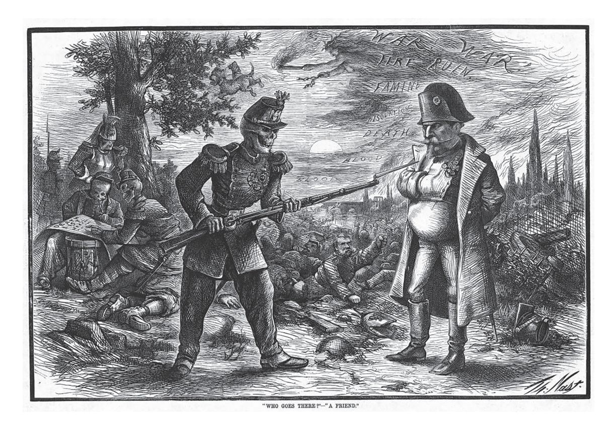
A cartoon published in an American magazine, August 1870. Death is saying, 'Who goes there?' and Napoleon III replies, 'A friend'. Around Napoleon are the words 'War', 'Fire', 'Ruin', 'Famine', 'Desolation', 'Death', 'Blood'.