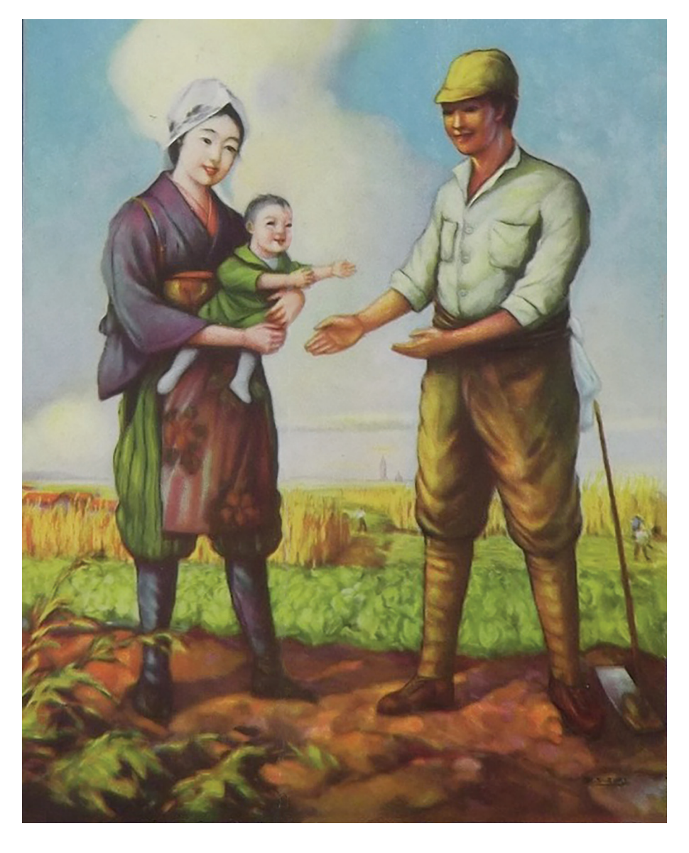
A poster published by the Japanese government in 1936 to celebrate the fifth anniversary of the Mukden Incident. It shows Japanese settlers in Manchukuo.