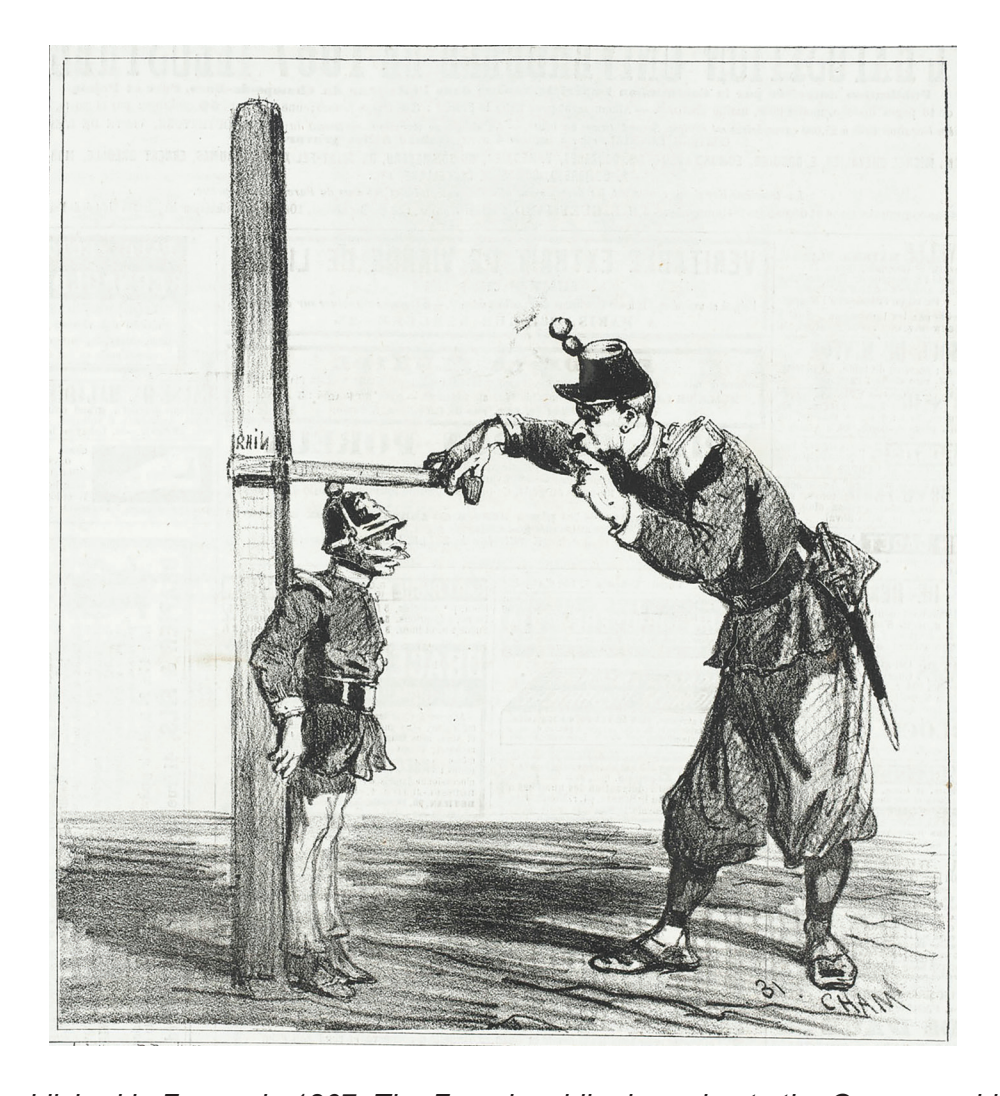
A cartoon published in France in 1867. The French soldier is saying to the German soldier, 'Now you are big enough. You must not get any bigger. I'm telling you this for your own health.'