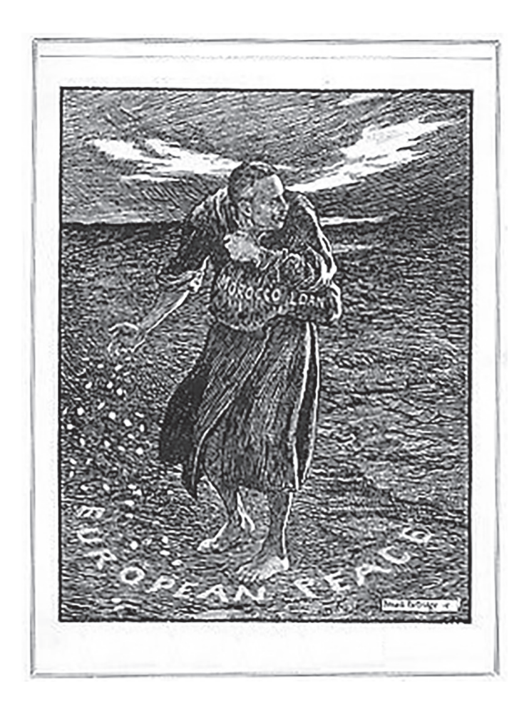
A cartoon published in a British magazine, August 1905. The title of the cartoon is 'The spreader of harmful weeds'. The figure represents the Kaiser.