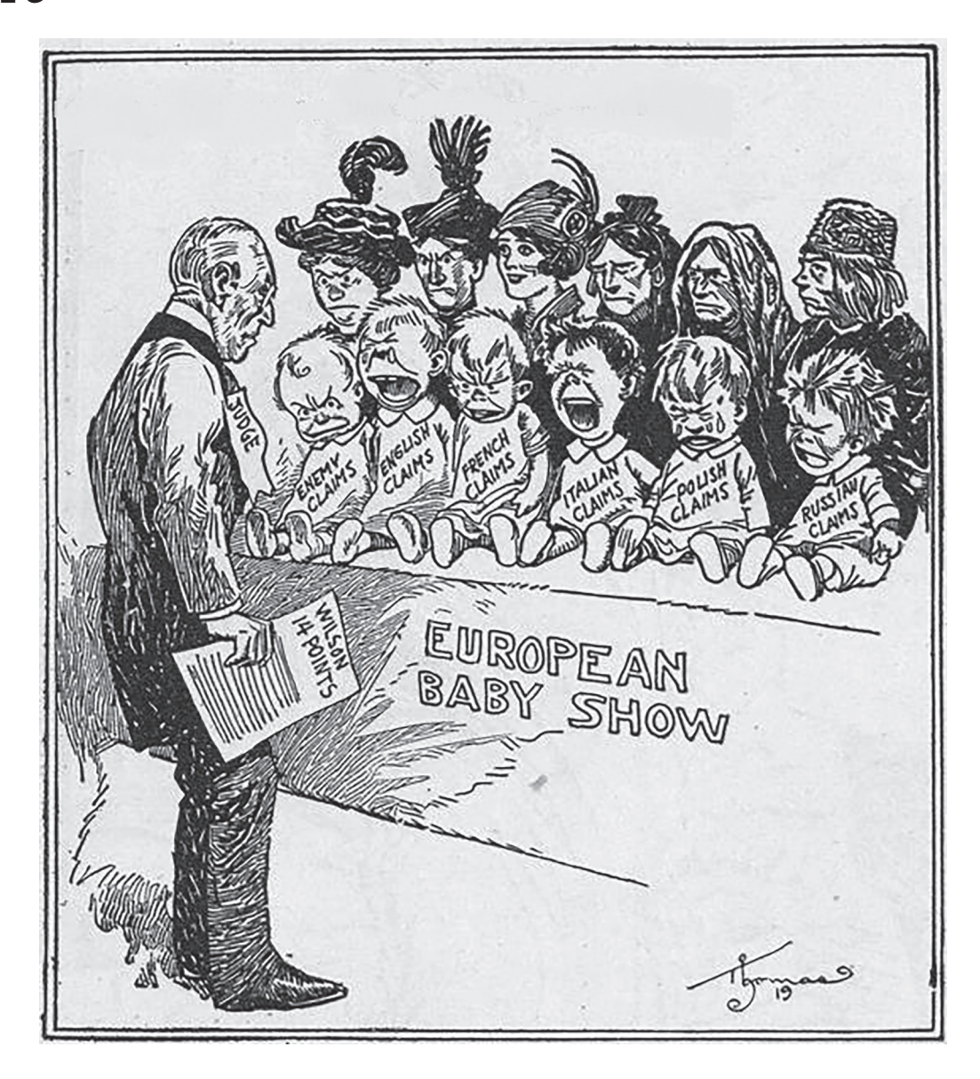
A cartoon published in an American newspaper, June 1919.