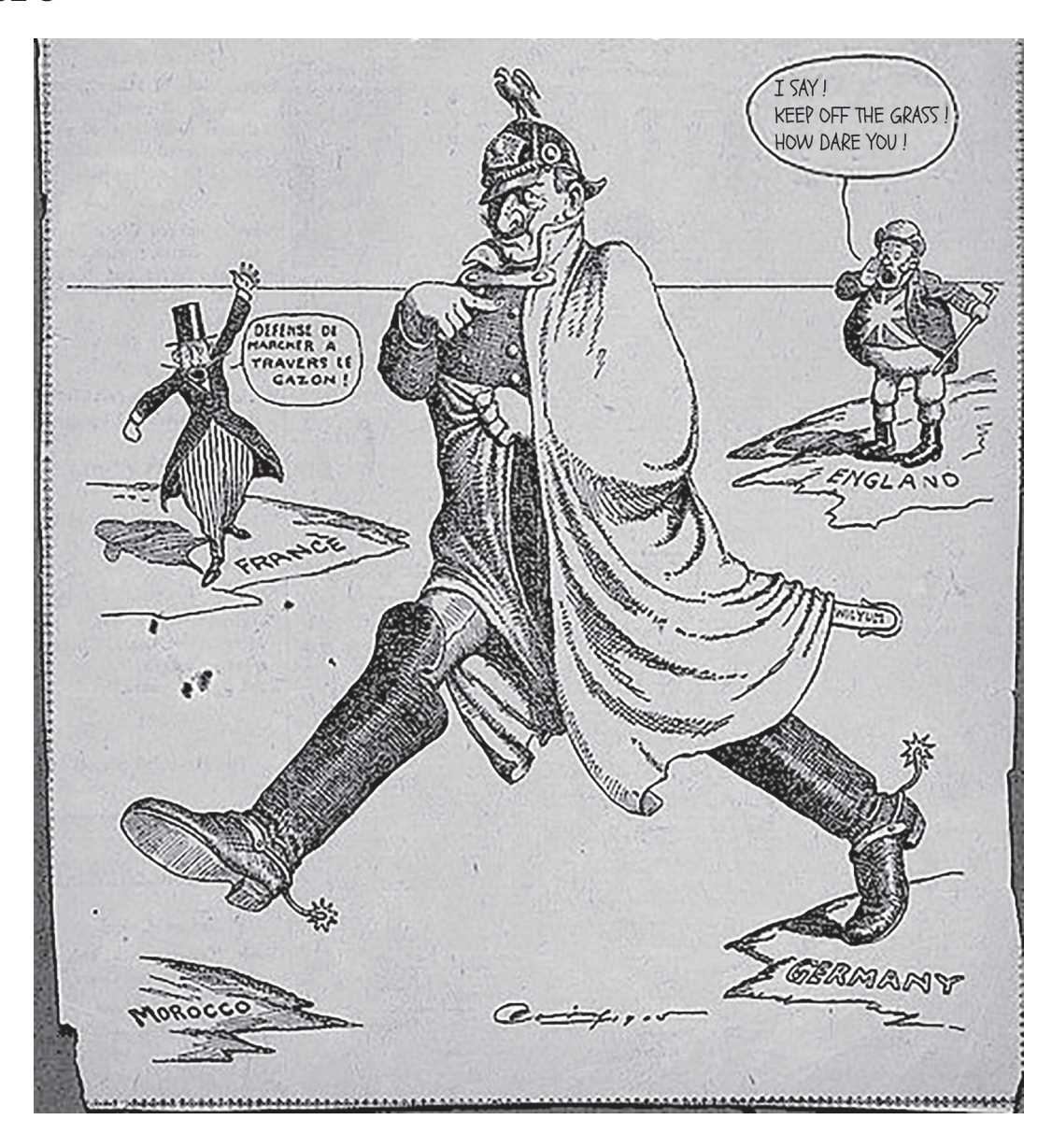
A cartoon published in a British magazine, 29 April 1905. France is shouting, 'Forbidden to walk on the grass!'