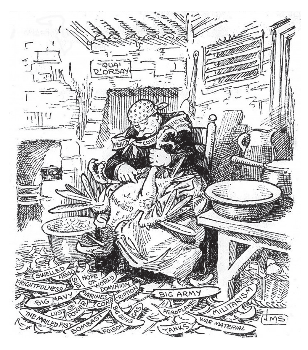
A British cartoon published in March 1919. The Quai d'Orsay was the address of the French Ministry of Foreign Affairs.