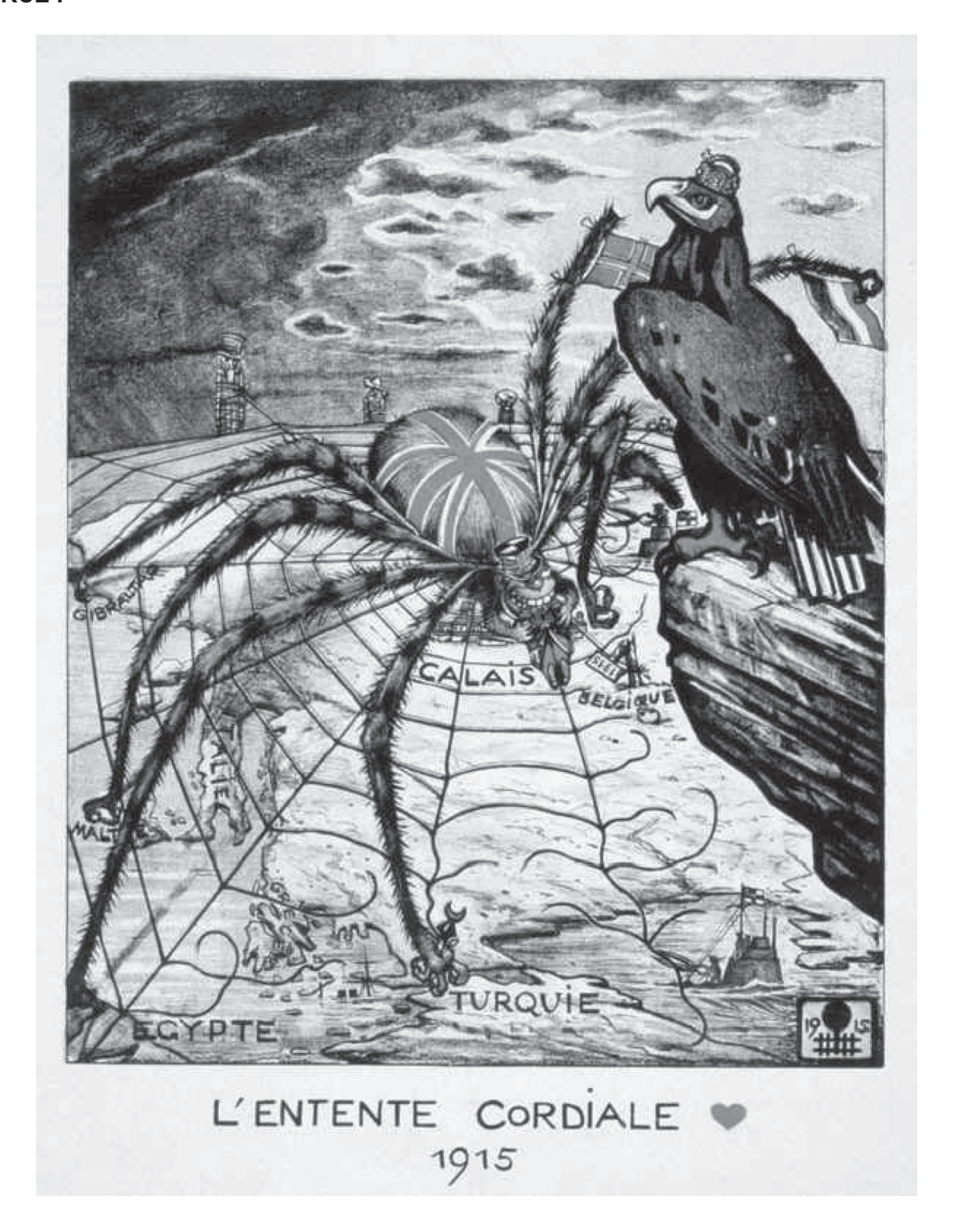
A German cartoon, published in the area of France they were occupying, 1915. The eagle represents Germany. One of the countries tied up in the spider's web is the USA.