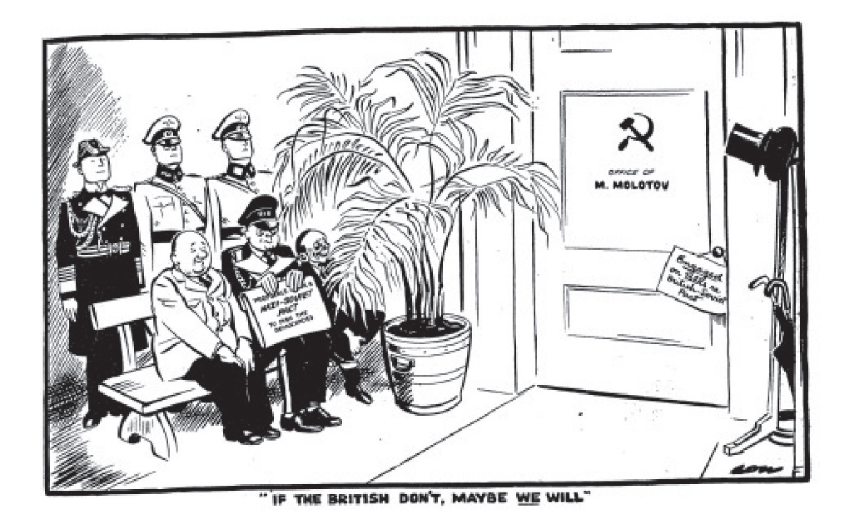
A British cartoon published on 29 June 1939. The figures sitting down are senior members of the German government. The writing on the folder reads, 'Proposals for a Nazi–Soviet Pact to dish [defeat] the democracies'. The notice hanging on the door handle reads, 'Engaged on talks re British–Soviet Pact'.