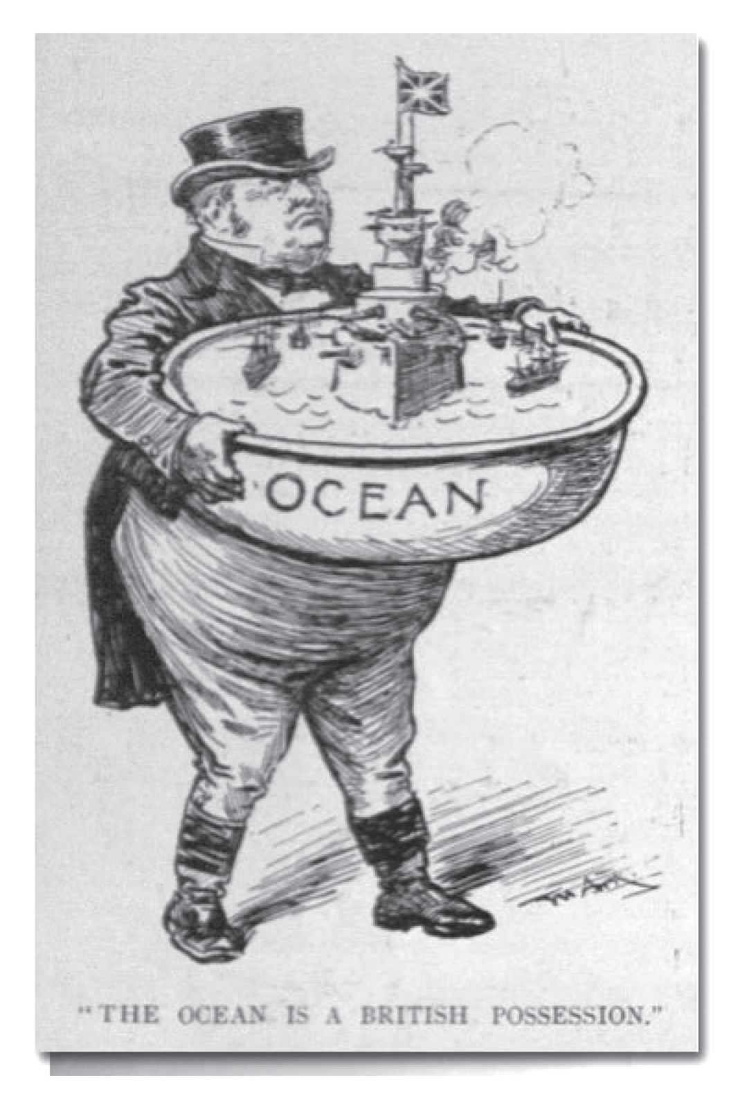
A cartoon published in an American magazine, 1900.