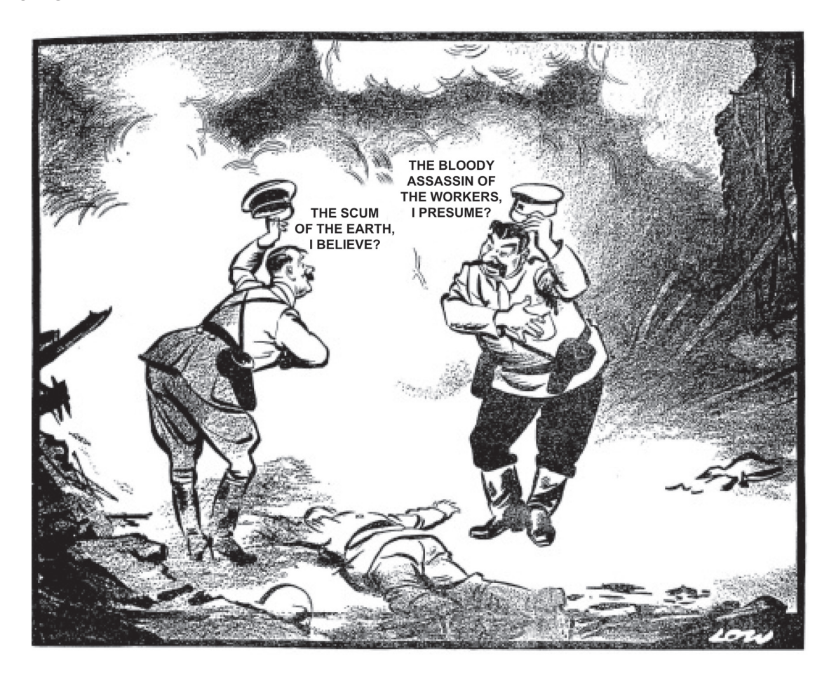
A British cartoon, 20 September 1939.