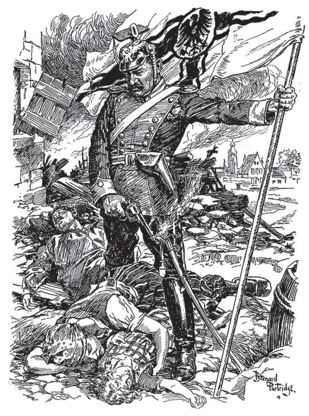
THE TRIUMPH OF "CULTURE."

A cartoon published in Britain, 26 August 1914.