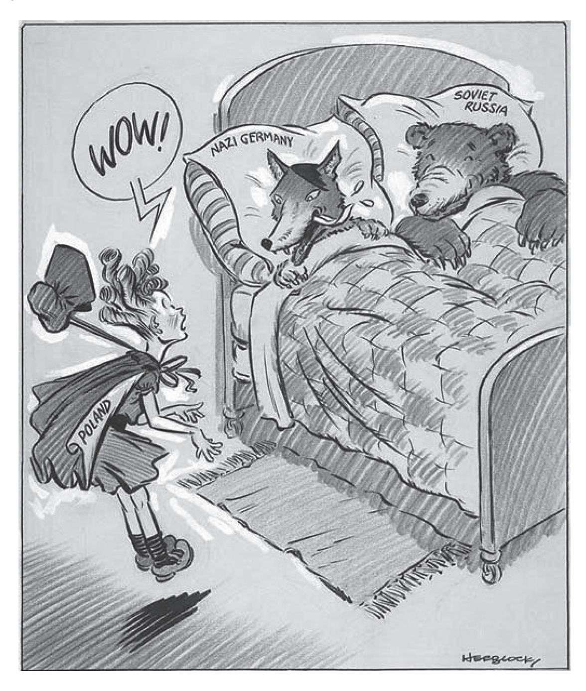
An American cartoon, 24 August 1939.