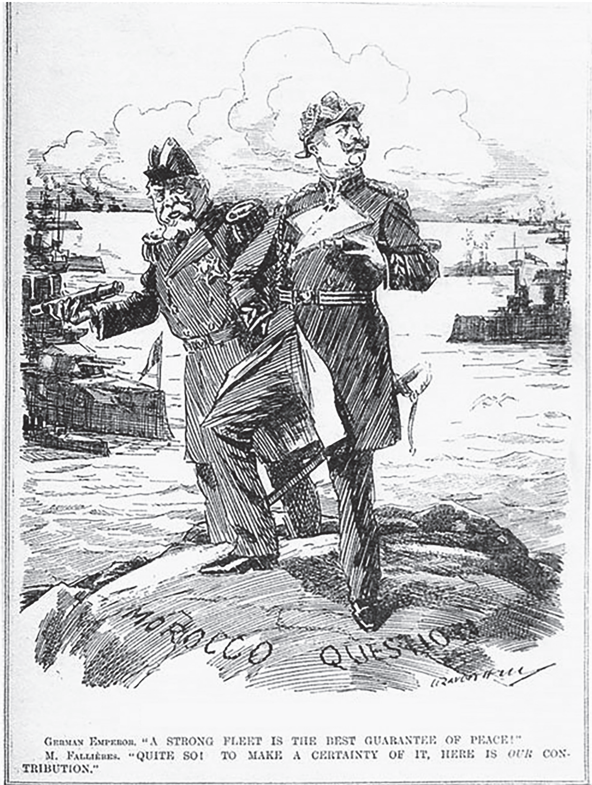
A British cartoon published on 12 September 1911. Fallières was President of France.