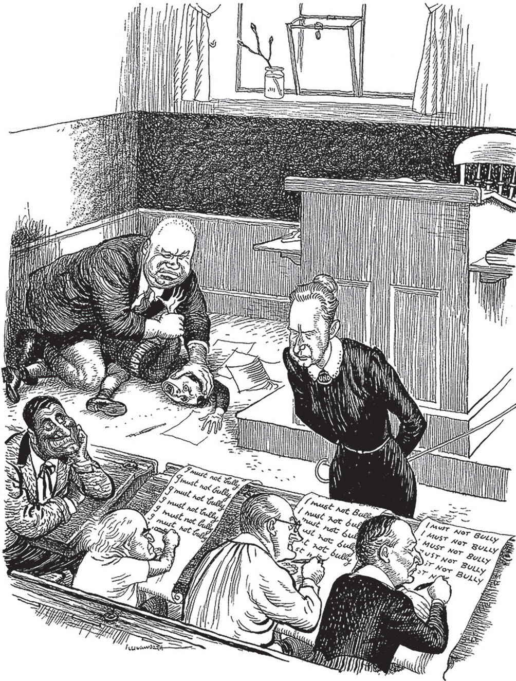
A cartoon published in Britain, 28 November 1956. The figures sitting represent President Nasser of Egypt, and Israel, Britain and France. The figure standing represents the United Nations.