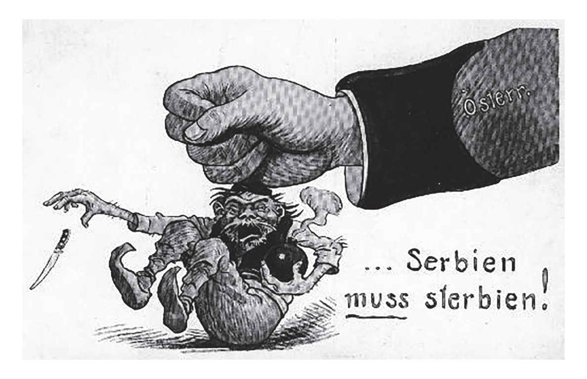
A cartoon published in Austria-Hungary in July 1914. The word on the sleeve is 'Austria', while the words at the bottom say, 'Serbia must die!'