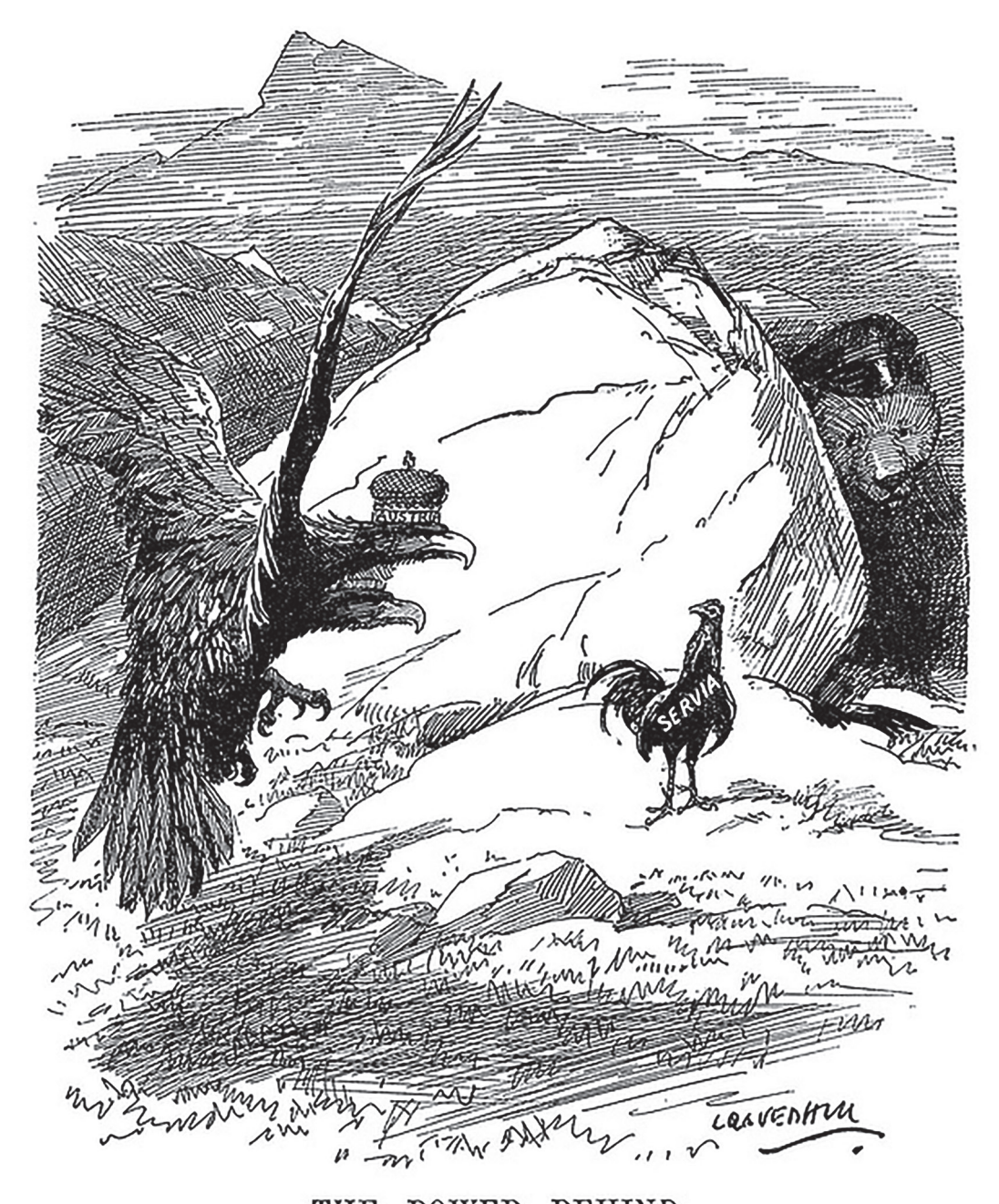
THE POWER BEHIND.

Austria (at the ultimatum stage). "I DON'T QUITE LIKE HIS ATTITUDE. SOMEBODY MUST BE BACKING HIM."