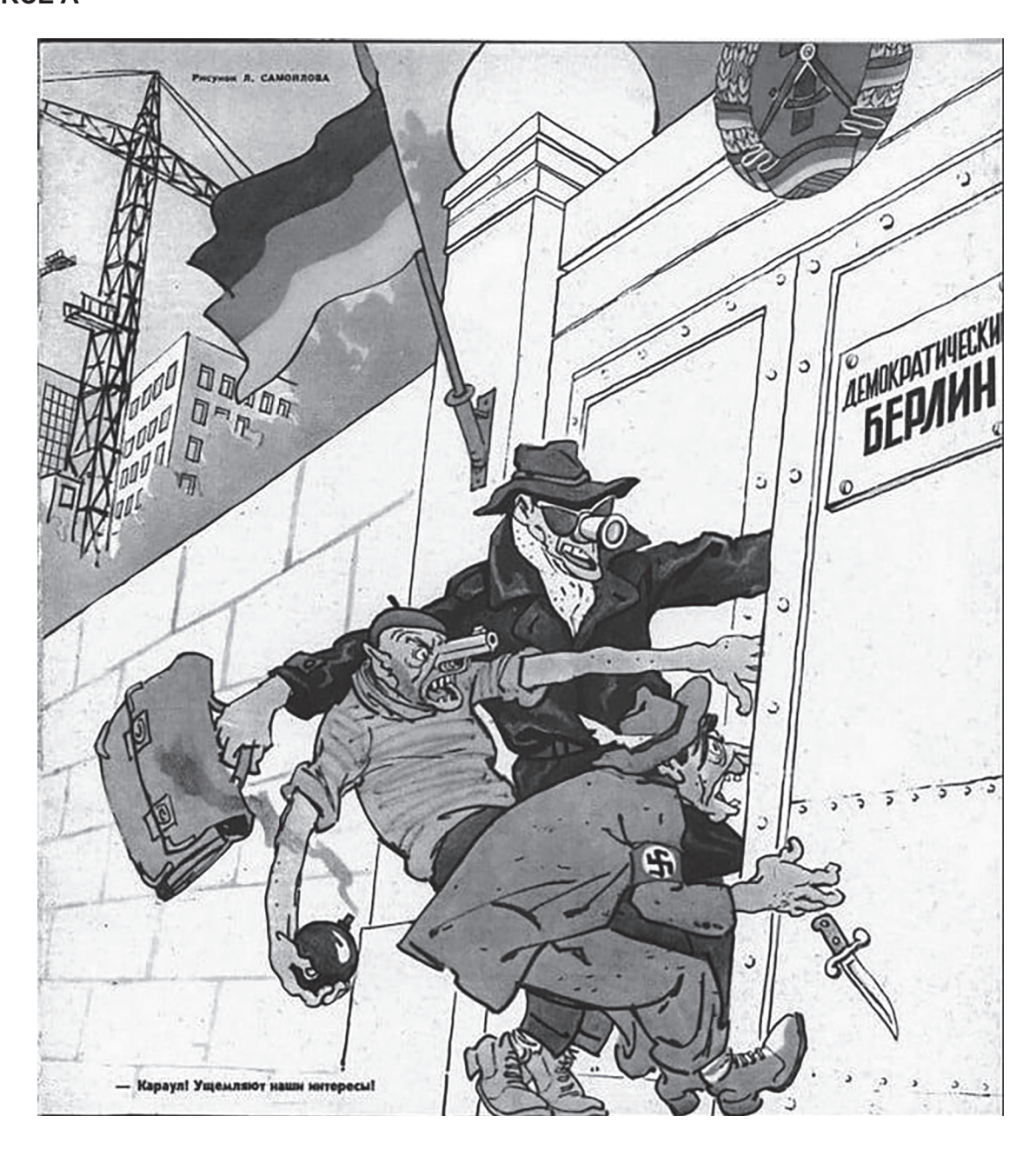
A cartoon from a magazine published in the Soviet Union in 1961 just after the Berlin Wall was constructed. The words on the wall say, 'Democratic Berlin'. The men are saying, 'Help! Our intentions are blocked!' The badge above the door is the emblem of East Germany.