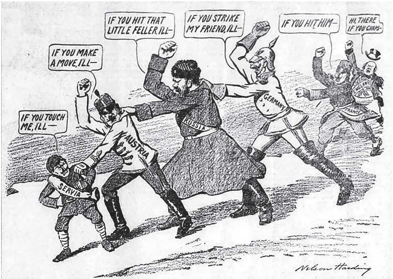
A cartoon published in an American newspaper with the title 'The Chain of Friendship', July 1914.