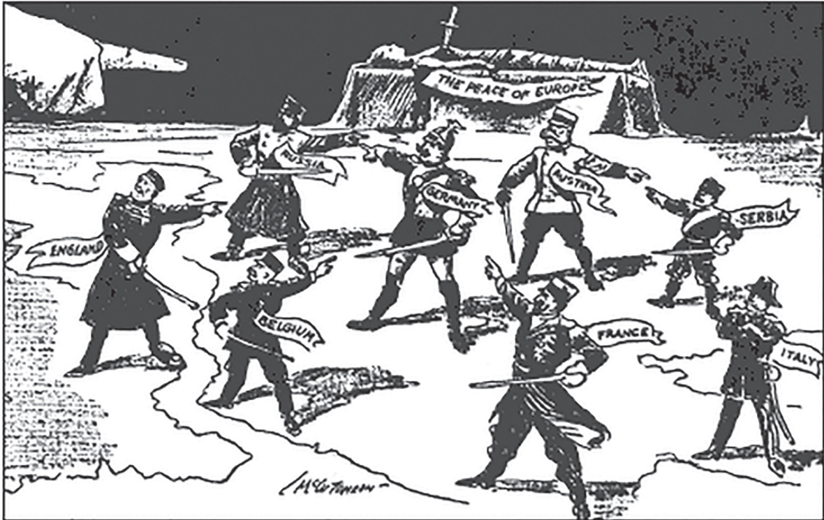
A cartoon published in an American newspaper, 5 August 1914.