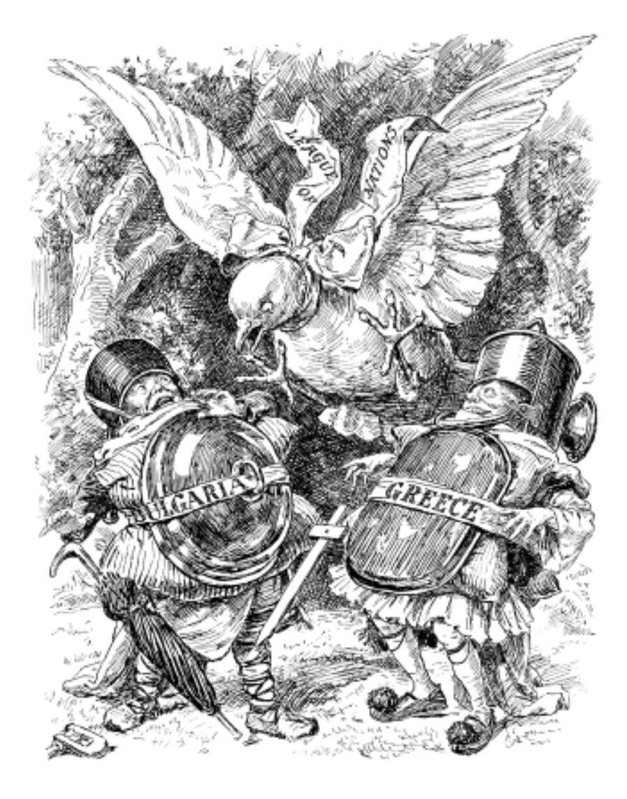
"JUST THEN CAME DOWN A MONSTROUS DOVE WHOSE FORCE WAS PUBLLY MORAL, WHICH TURNED THE HEROES' HEARTS TO LOVE AND MADE THEM DROP THEIR QUARREL."

A British cartoon published in November 1925.