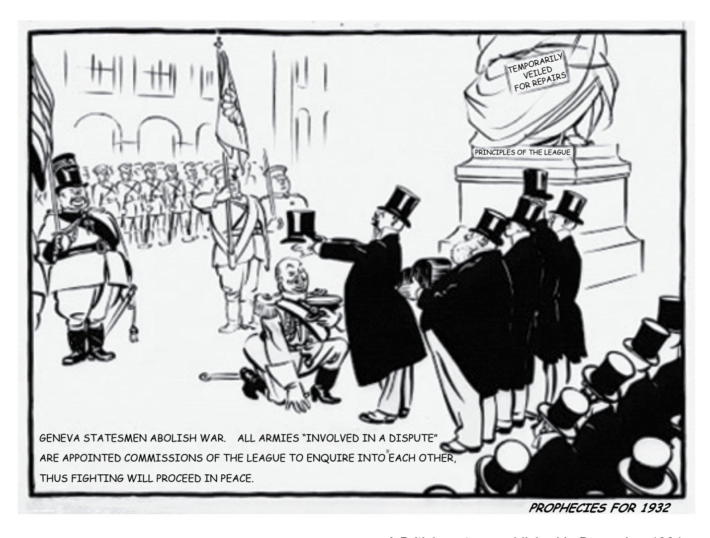
A British cartoon published in December 1931.