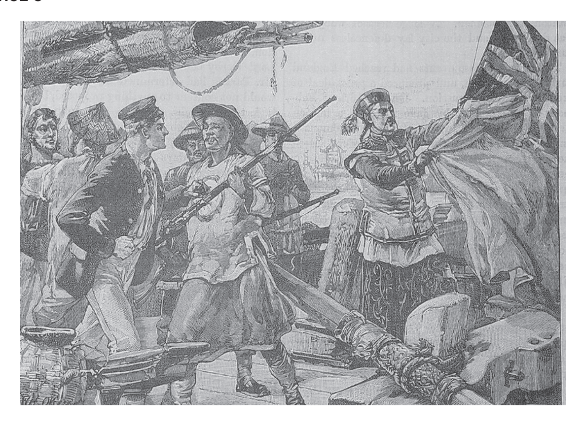
An illustration of events on the Arrow published in a British magazine in October 1856.