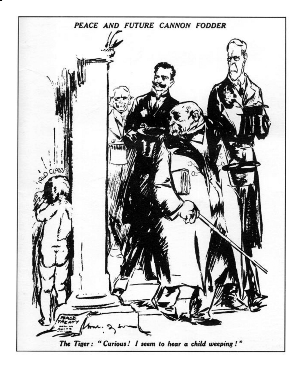
A cartoon published in a British newspaper, May 1919. 'The Tiger' refers to Clemenceau.