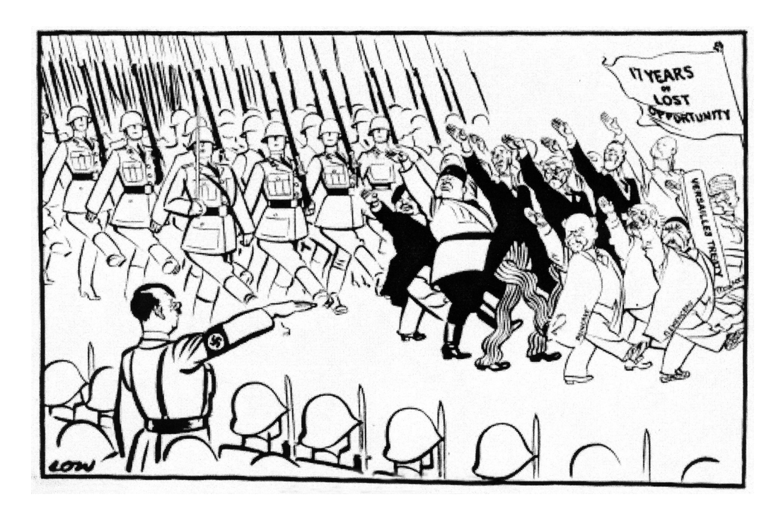
A cartoon, entitled 'Cause Precedes Effect', published in a British newspaper, 1935. It shows a parade of world statesmen led by the Versailles peacemakers.