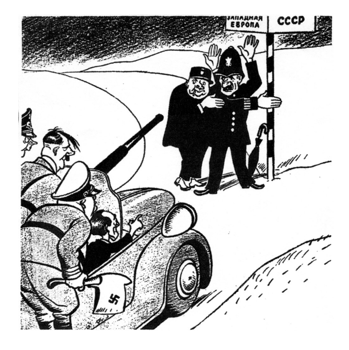
A cartoon published in the Soviet Union, 1939. The signpost says left to western Europe and right to the USSR.