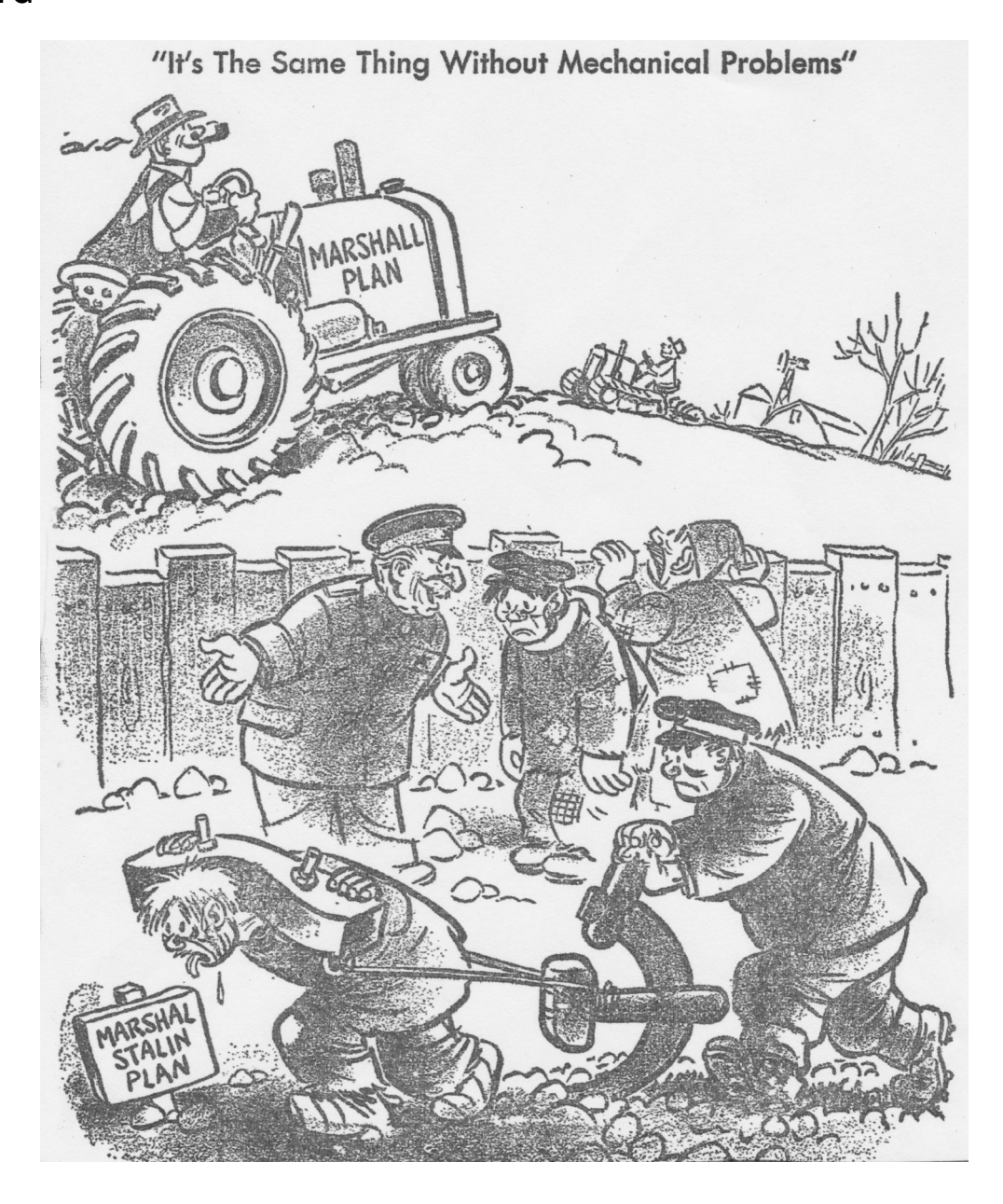
A cartoon published in the USA, January 1949.