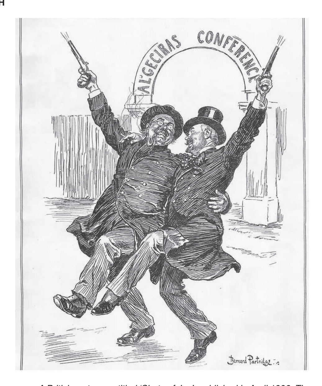
A British cartoon entitled 'Shots of Joy', published in April 1906. The caption to the cartoon read 'The Algeciras Conference has practically been concluded to the mutual satisfaction of the two rival powers whose differences at one time threatened to end in something worse than a diplomatic duel.'