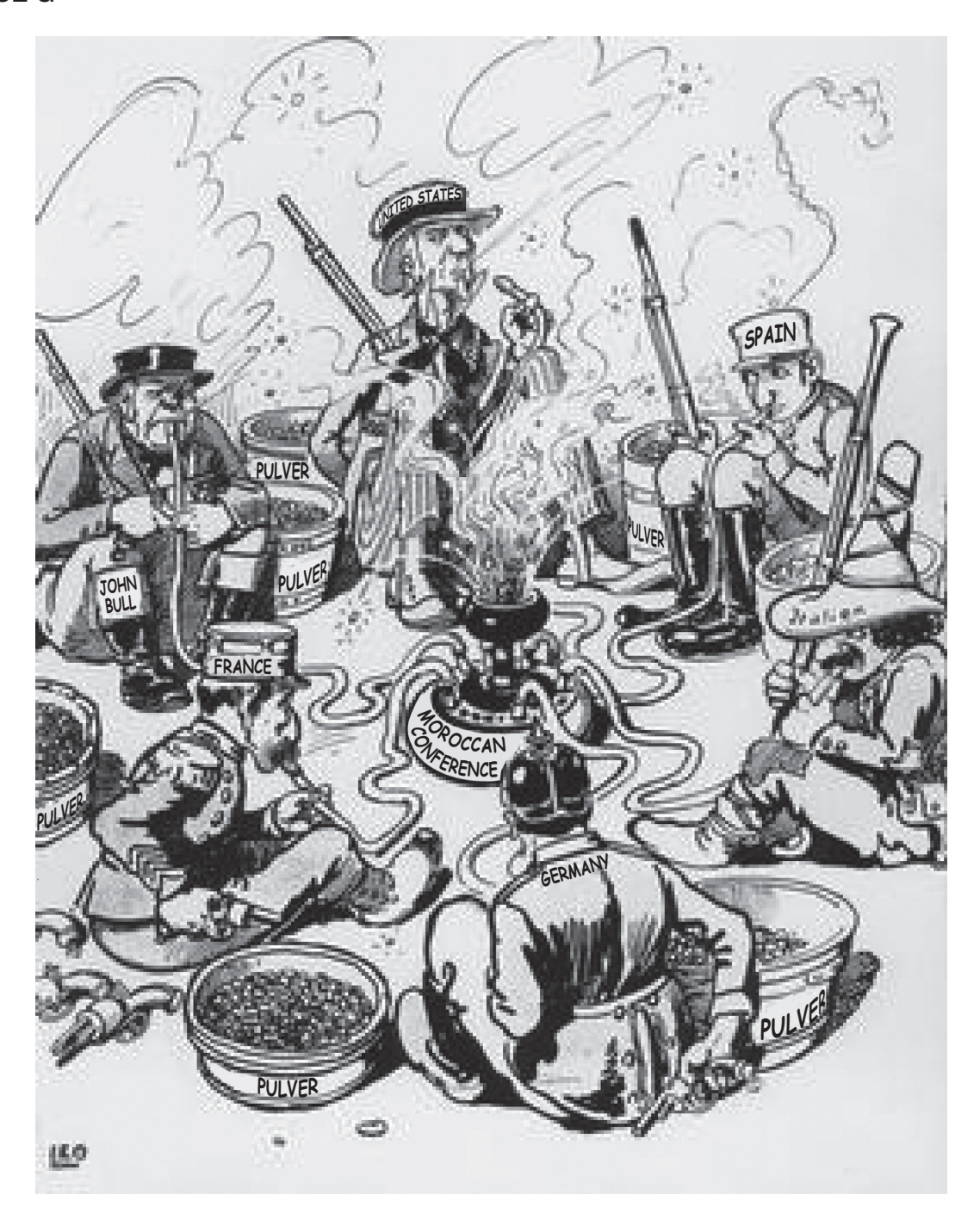
A German cartoon published in February 1906. The caption to the cartoon read 'At the Moroccan Conference: enthusiasm for smoking the peace pipe does not exclude the danger of a general explosion.' Pulver means gunpowder.