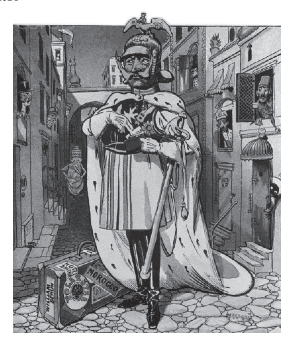
A British cartoon published in 1905. The caption to this cartoon read 'The Morocco Crisis: Let men see - whom shall I call on next?'