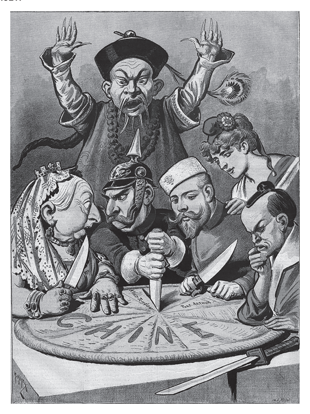
A cartoon published in a French magazine, 1898. The caption reads 'China – the cake of kings and of emperors'. The countries around the table are, from left to right, Britain, Germany, Russia, France and Japan.