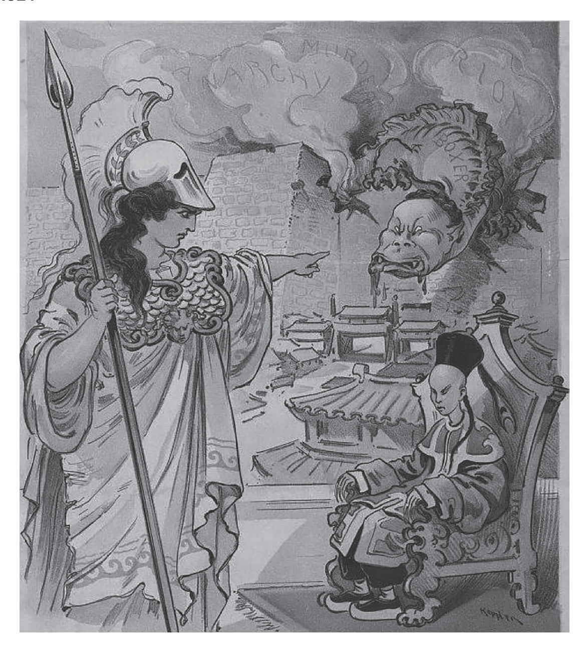
A cartoon published in an American magazine, August 1900. The caption reads 'The First Duty. Civilization speaking to China: "That dragon must be killed before our relationship can be improved. If you don't do it, I shall have to."'