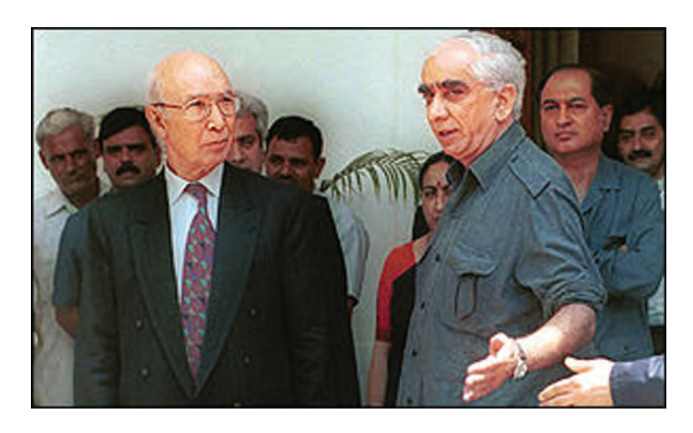
The Foreign Ministers of India and Pakistan during talks on Kashmir, June 1999

Explain why it is so difficult to resolve the Jammu and Kashmir conflict.