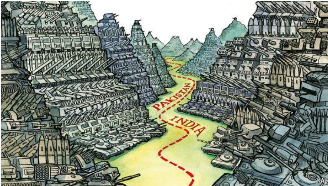
Economist , 19 May 2011

A recent cartoon in the Economist might be useful in classroom discussions on India's foreign policy (Paper 1 Theme 4) and the Jammu-Kashmir dispute (Paper 2 Case Study 3).