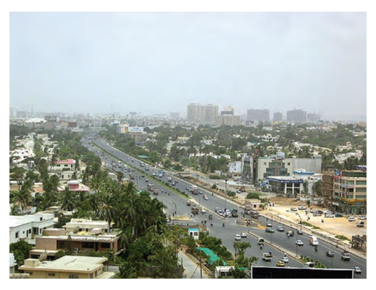
Photograph B for Question 3