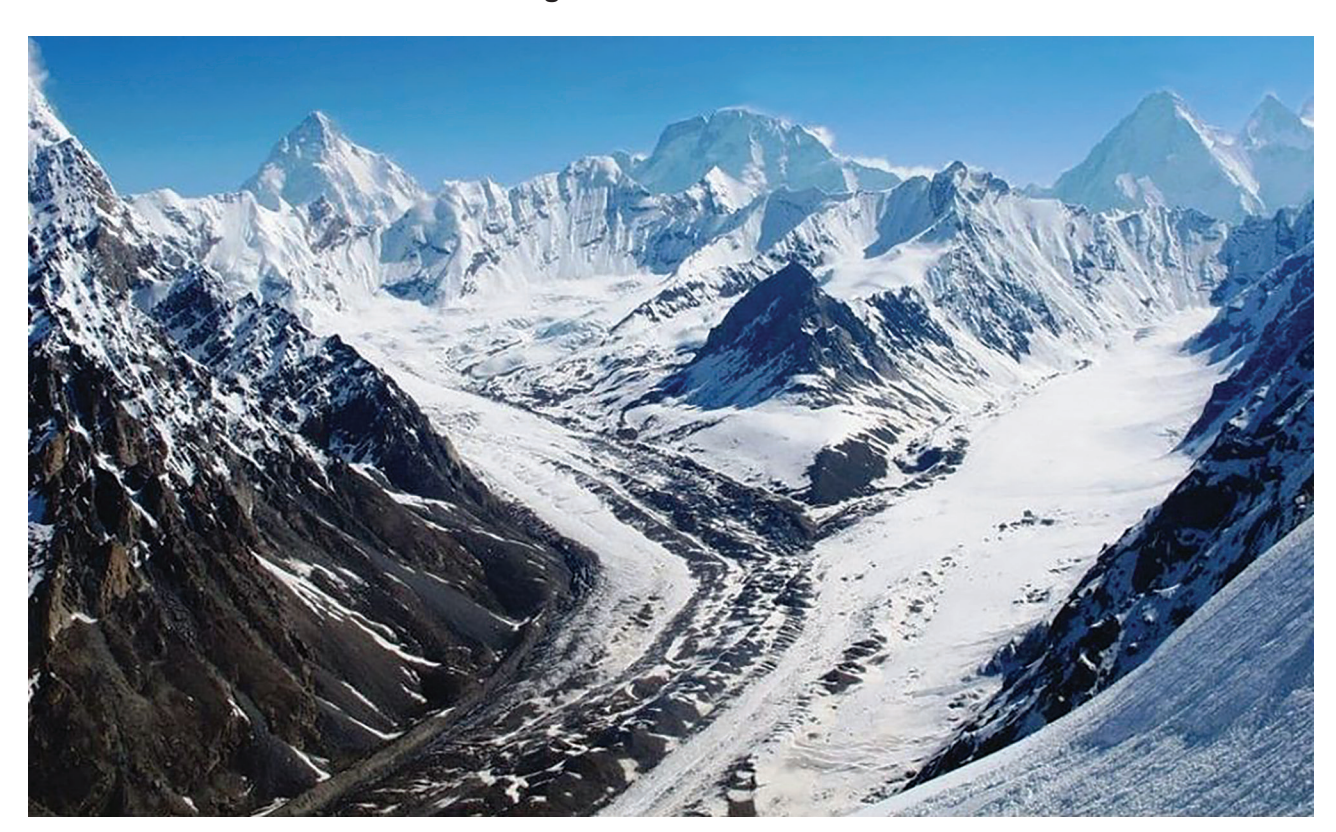
Fig. 1.2 for Question 1