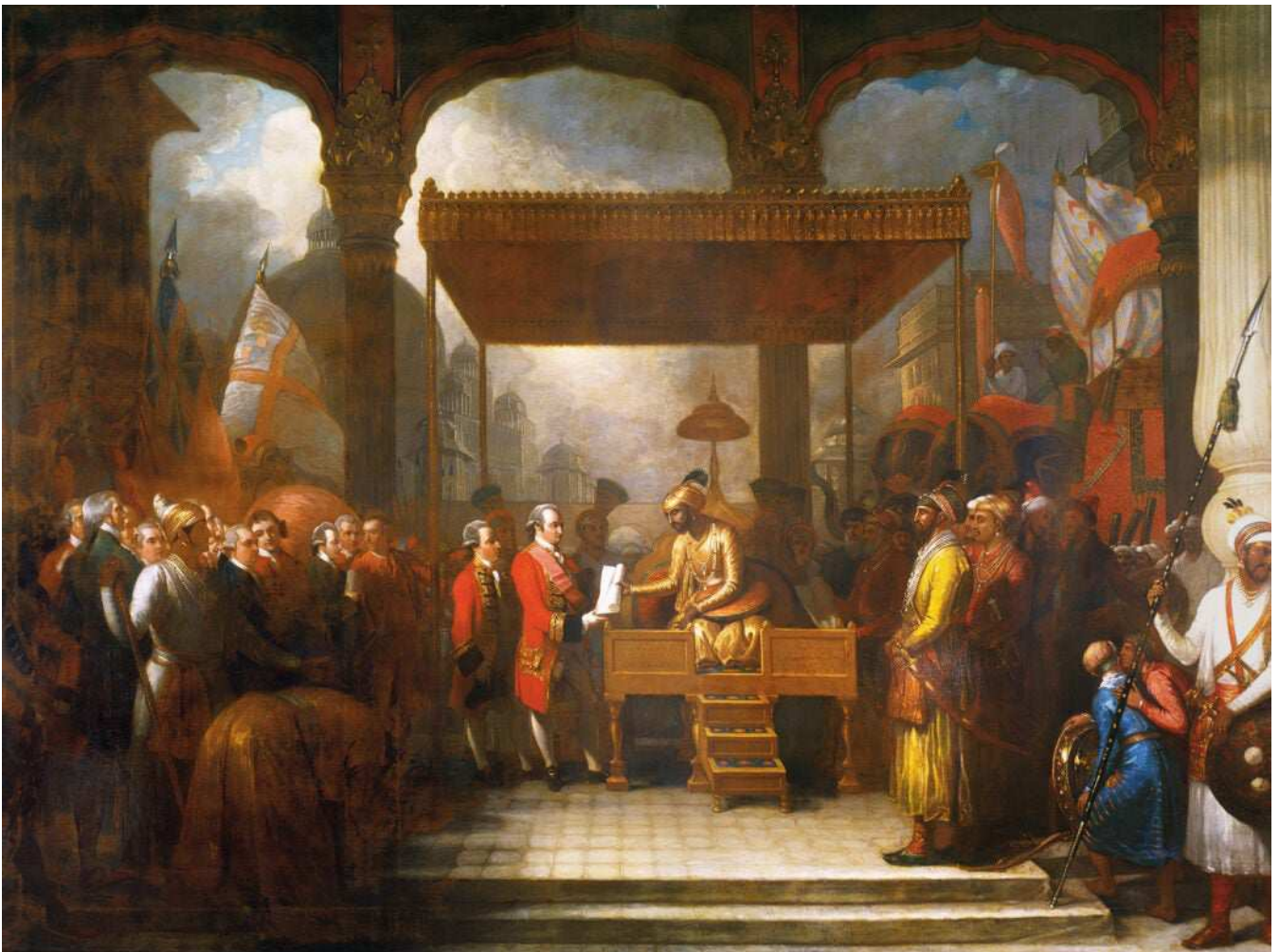
A representation of the meeting between the East India Company and Shah Alam II to discuss trading rights in the subcontinent. Painted by Benjamin West, a British-American artist, in c.1818.

Permission to reproduce items where third-party owned material protected by copyright is included has been sought and cleared where possible. Every reasonable effort has been made by the publisher (UCLES) to trace copyright holders, but if any items requiring clearance have unwittingly been included, the publisher will be pleased to make amends at the earliest possible opportunity.