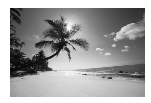
From only €699 pp

Contact your travel agent or book direct on +220 79642 311