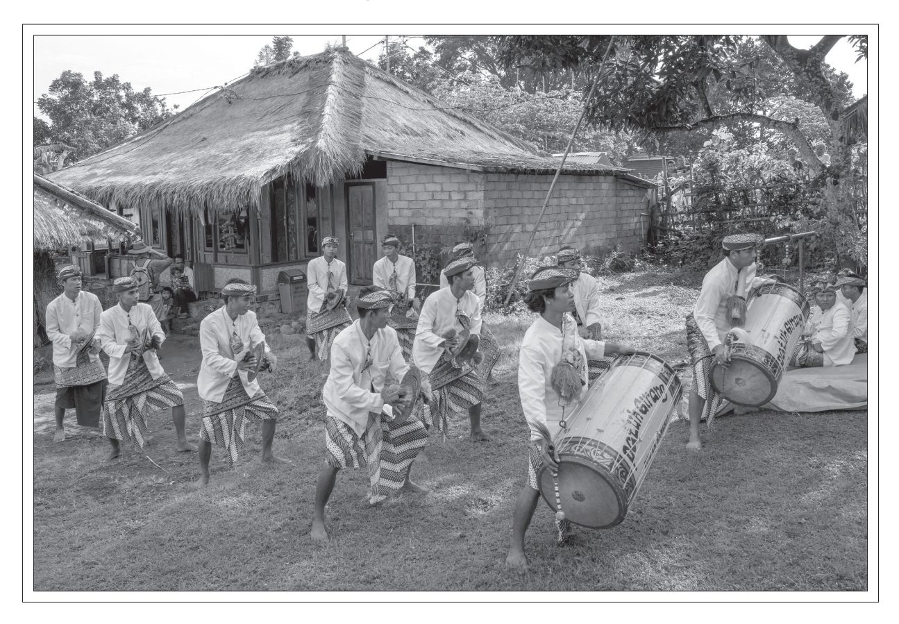
Fig. 3.1 for Question 3