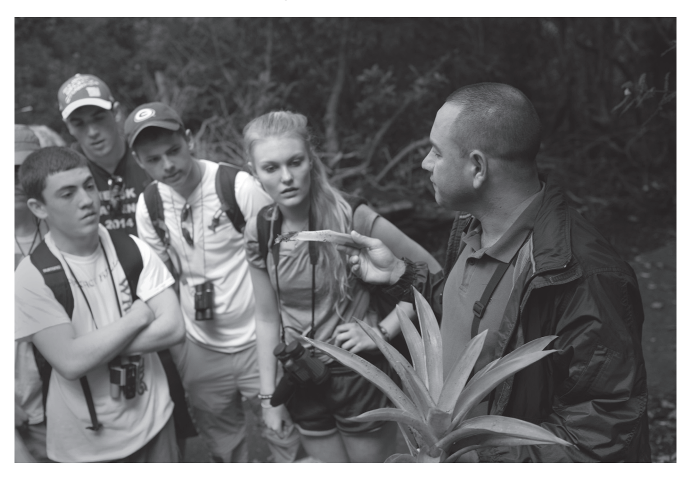
Fig. 2.1 for Question 2

However, the rate of recovery is not the same across all regions of the world.