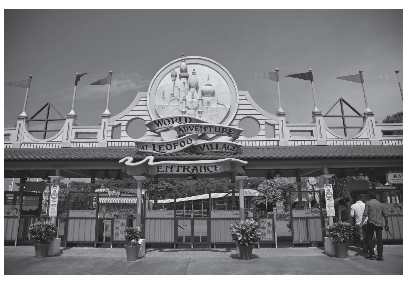
Fig. 4.1 for Question 4