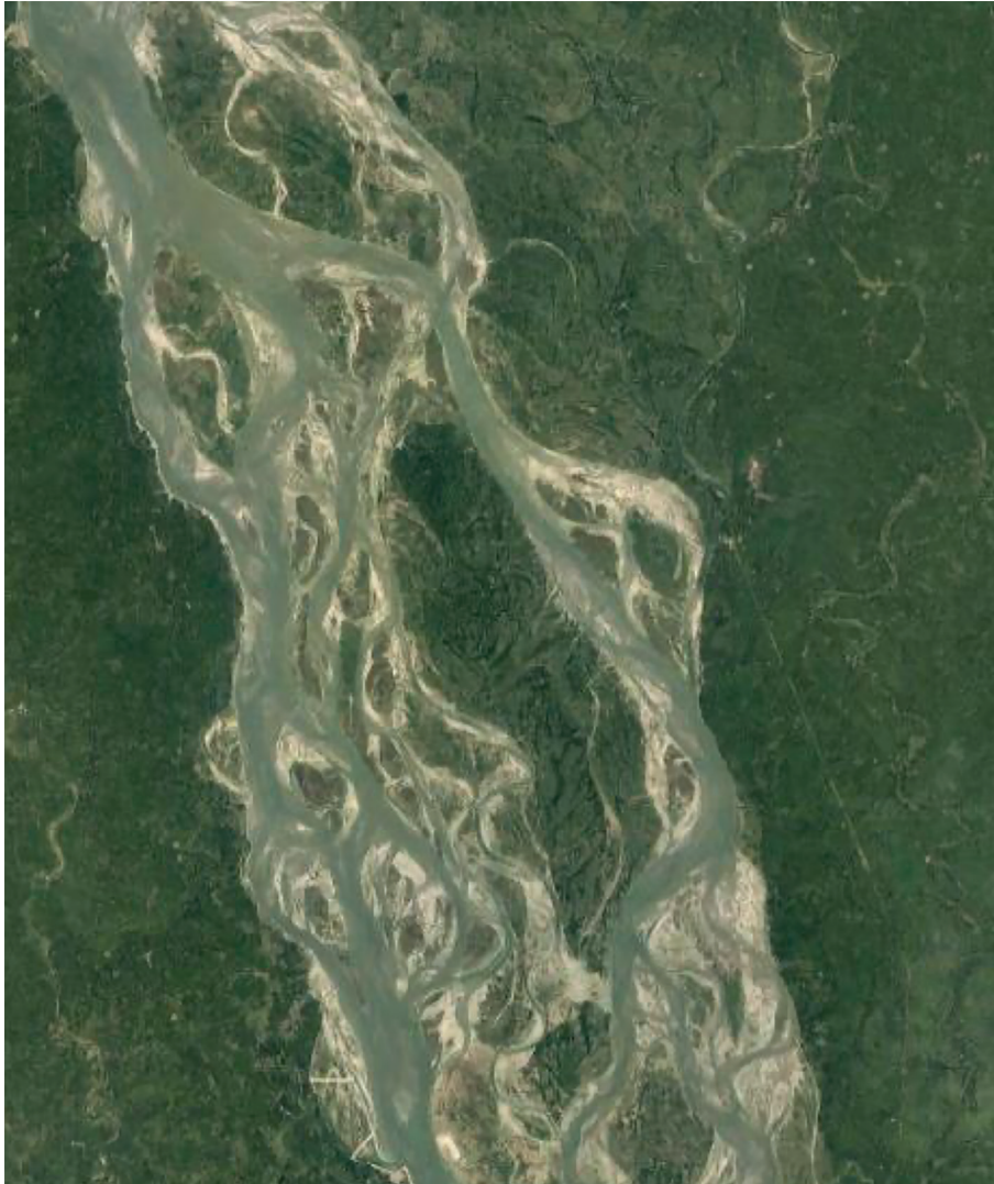
Satellite photograph of part of the Jamuna River