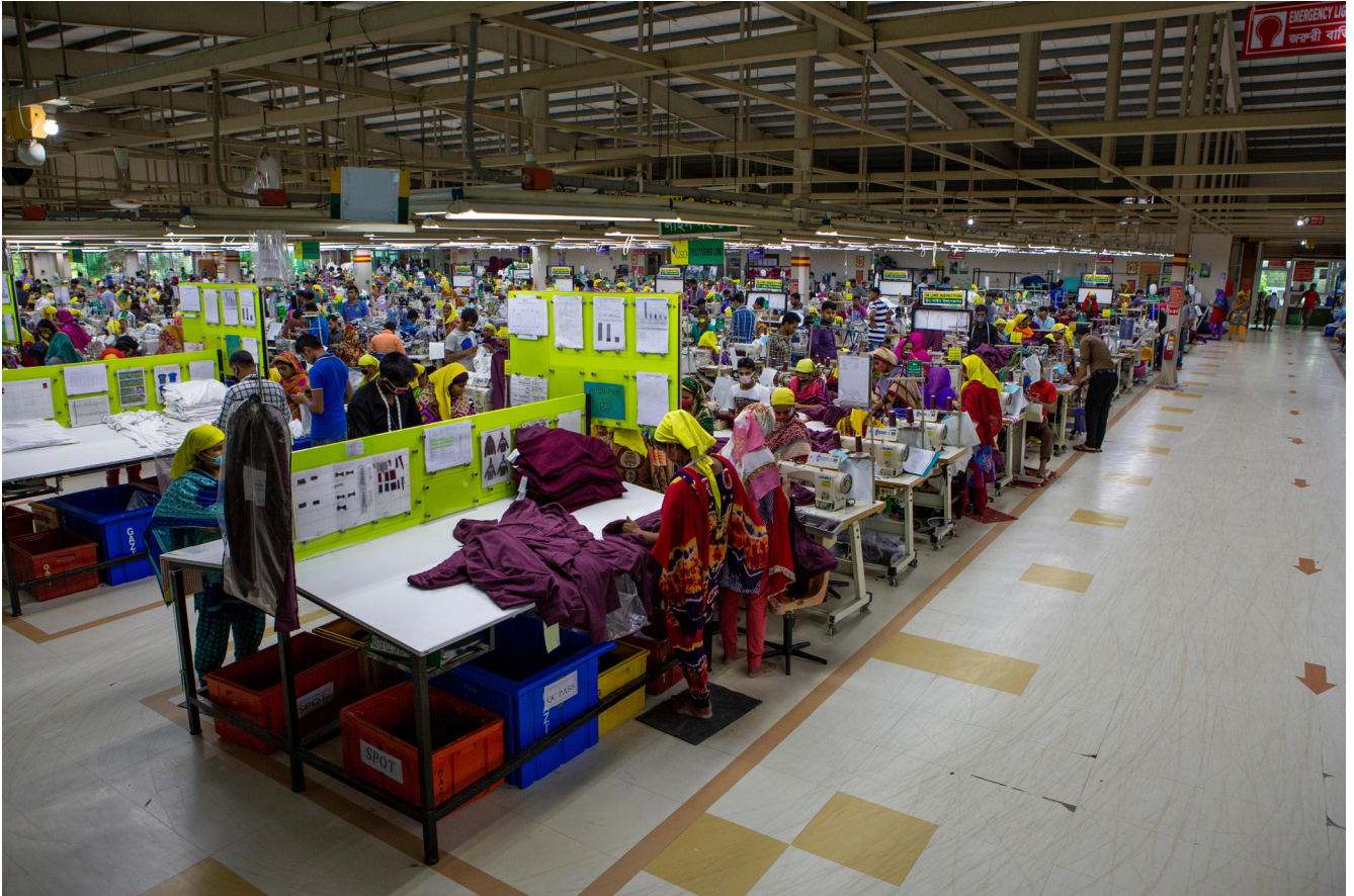
A garment factory in Bangladesh