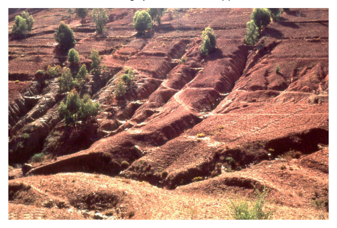
Photograph B for Question 6(c)