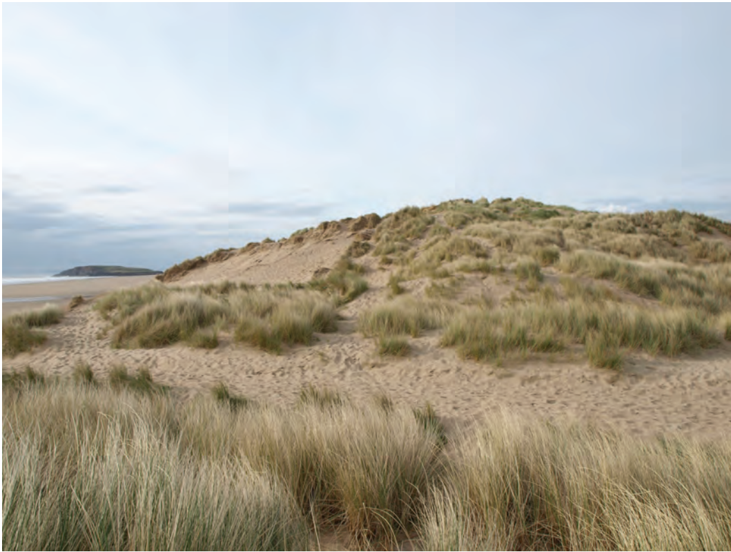
Photograph B for Question 3