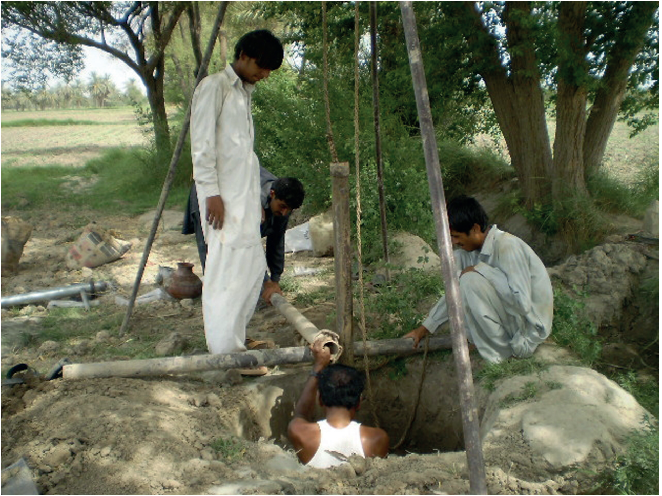
Photograph A for Question 5