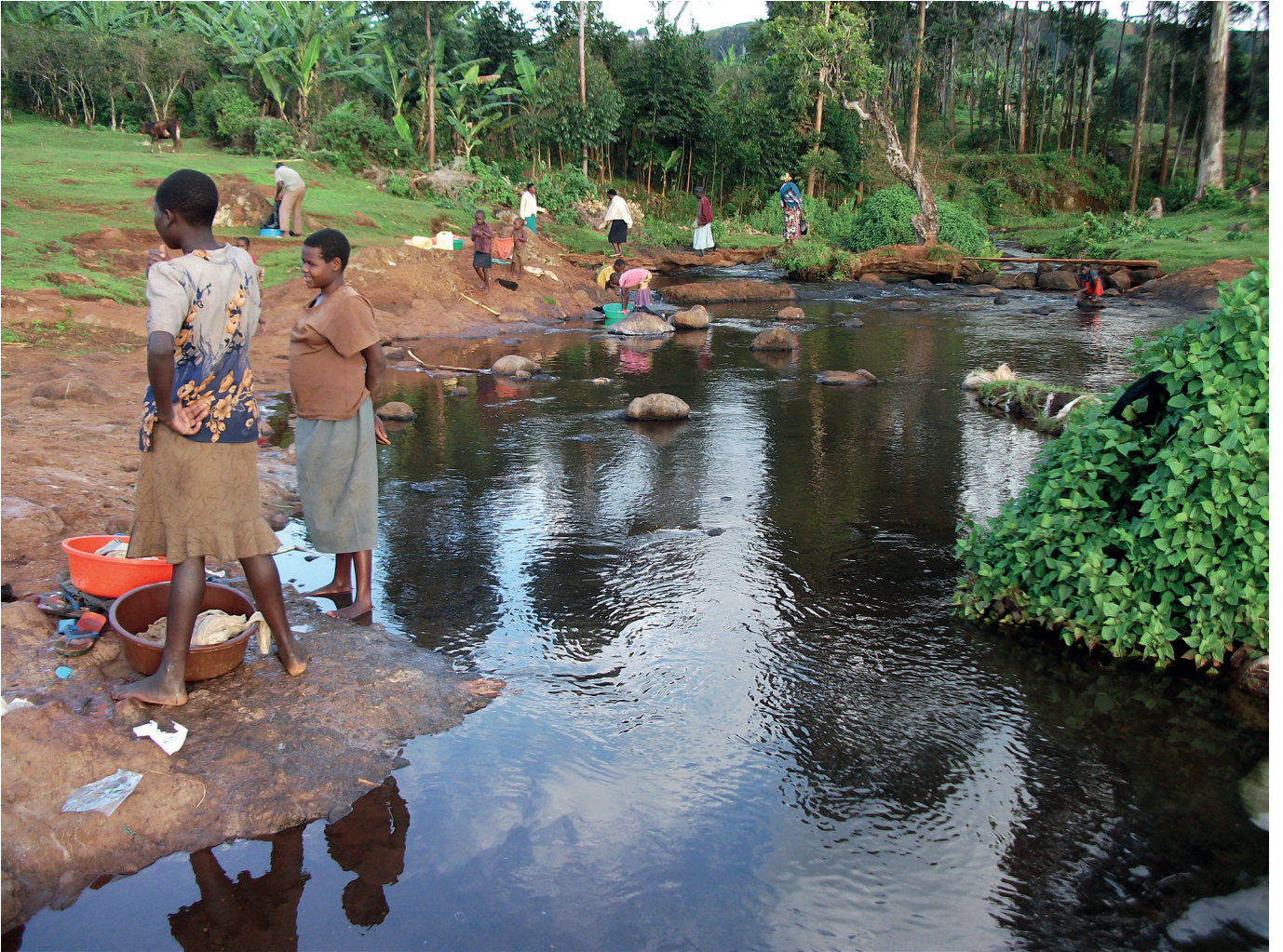
Photograph A for Question 4