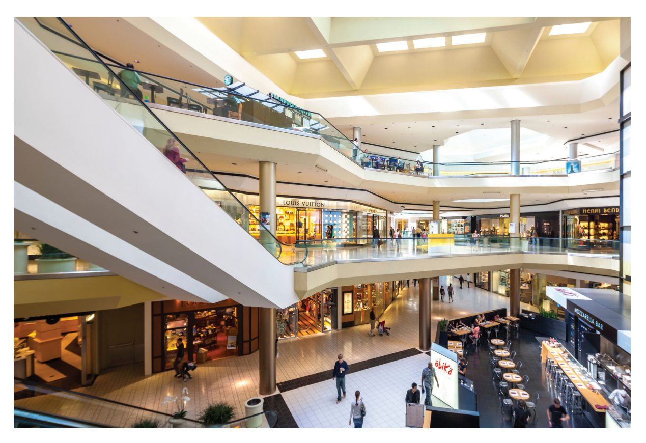
Fig. 3.2 for Question 3