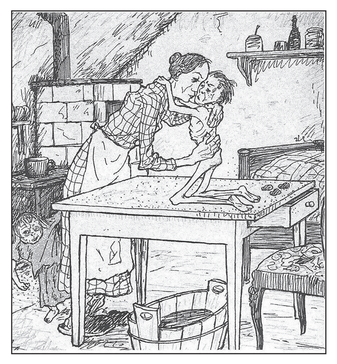
A cartoon entitled 'Consolation' published in a German magazine, 24 June 1919. The mother is saying to her child, 'When we have paid 100,000,000 marks, then I shall be able to give you something to eat.'