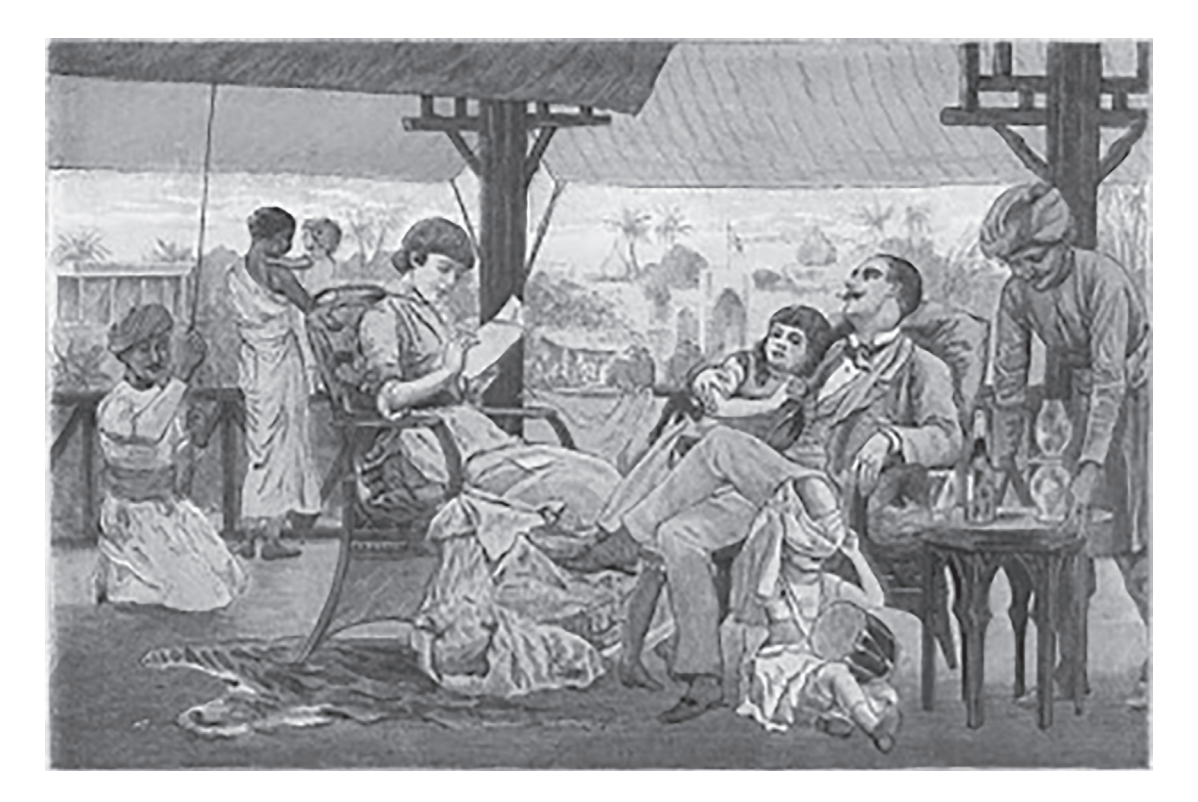
CHRISTMAS IN INDIA

A drawing of a British family living in India, published in a British magazine, 1881.