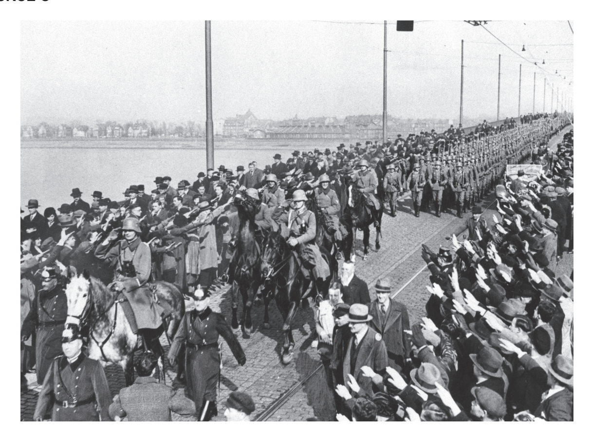
A photograph of German troops marching into the Rhineland, March 1936.