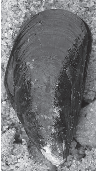
magnification \times 2 Fig. 5.1