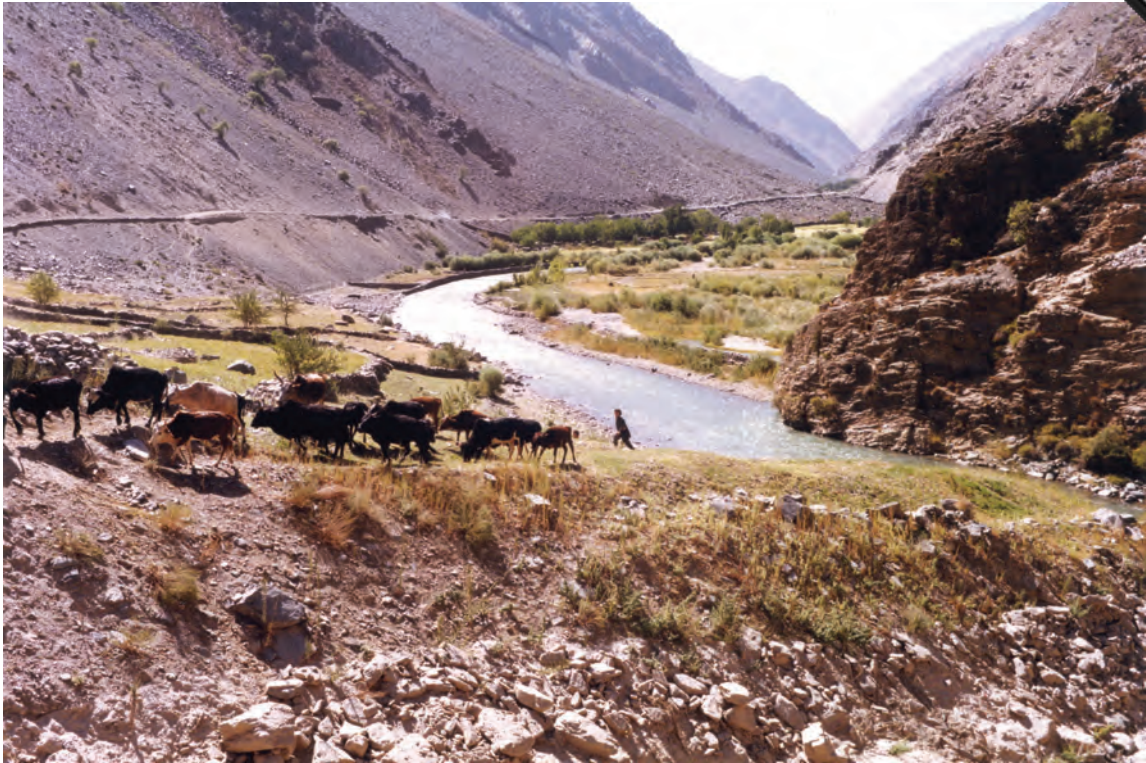
Fig. 3 for Question 2