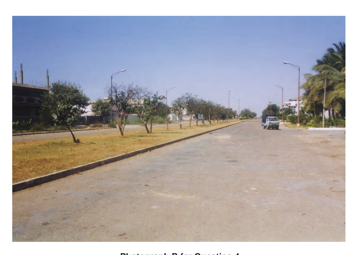
Photograph B for Question 4

Permission to reproduce items where third-party owned material protected by copyright is included has been sought and cleared where possible. Every reasonable effort has been made by the publisher (UCLES) to trace copyright holders, but if any items requiring clearance have unwittingly been included, the publisher will be pleased to make amends at the earliest possible opportunity.