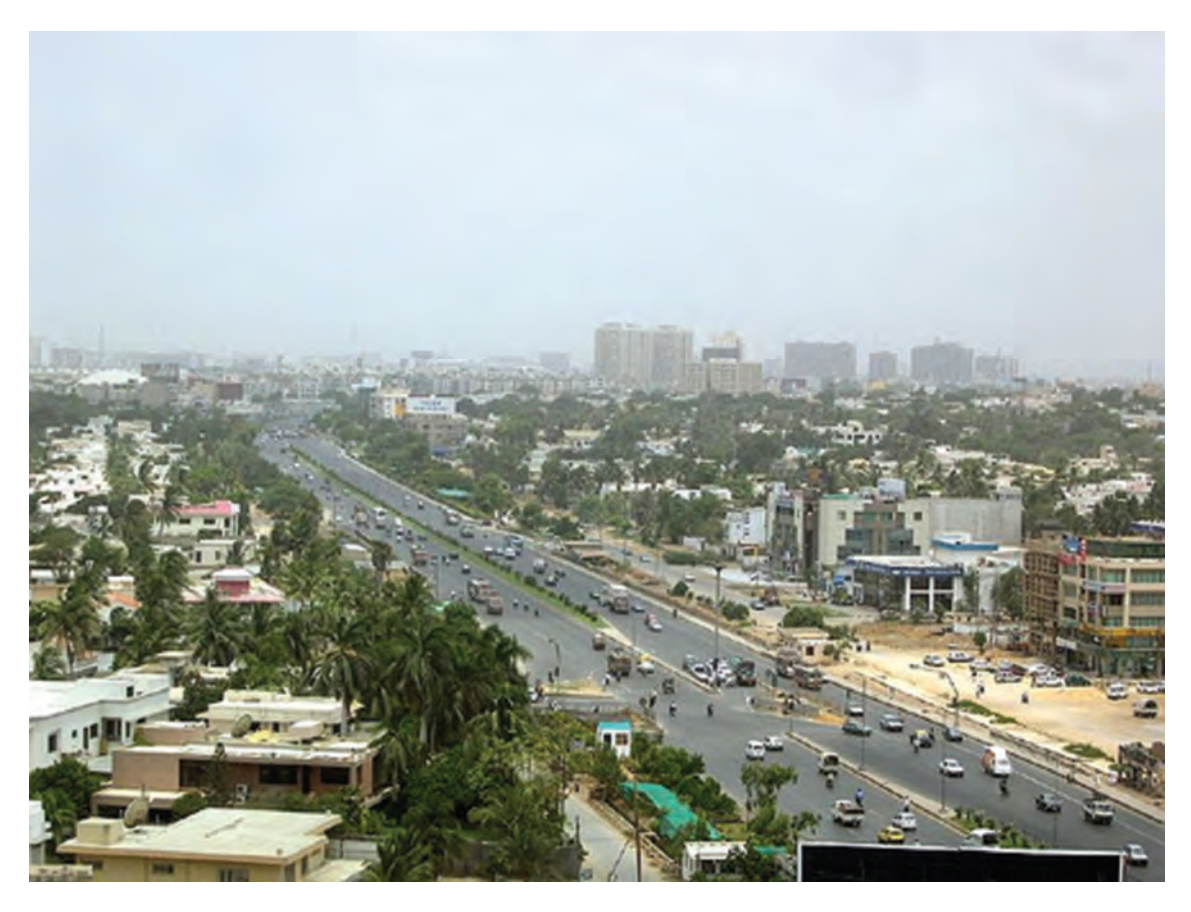
Photograph B for Question 3