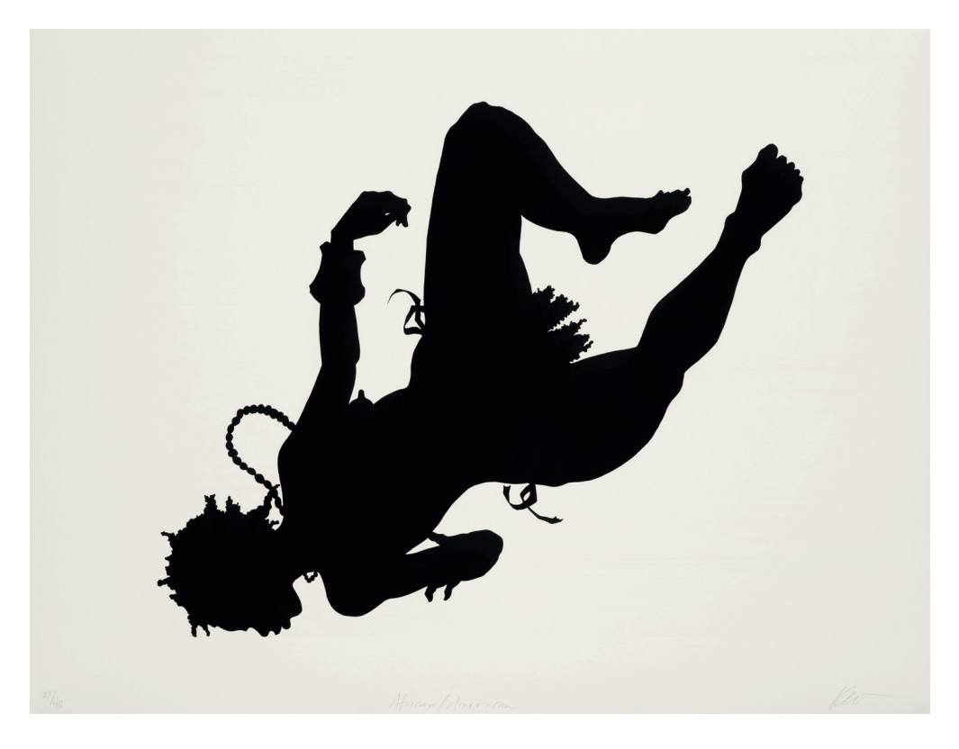
Section 4: Drawing, printing, photography, collage and film