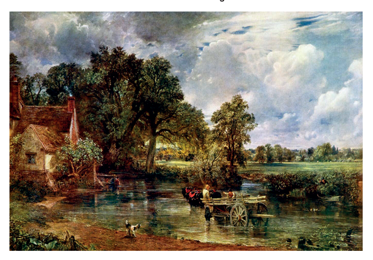
John Constable, The Hay Wain , 1821 (oil on canvas), (130 × 185 cm), (National Gallery, London)