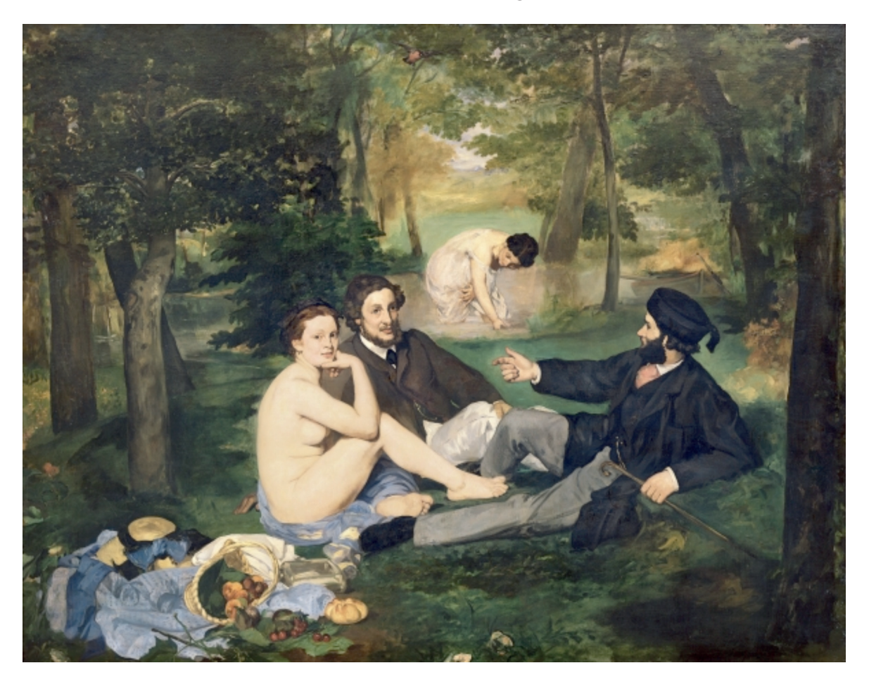
Édouard Manet, Luncheon on the Grass, 1863, (Oil on canvas), (2.14 × 2.79 m), (Musée d'Orsay, Paris)