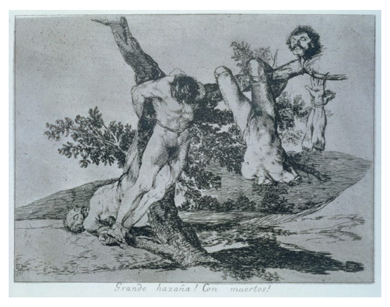
Section 4: Drawing, printing, photography, collage and film

Francisco Goya, Great Deeds Against the Dead , 1810–15, (etching and drypoint), (15.6 × 20.8 cm)