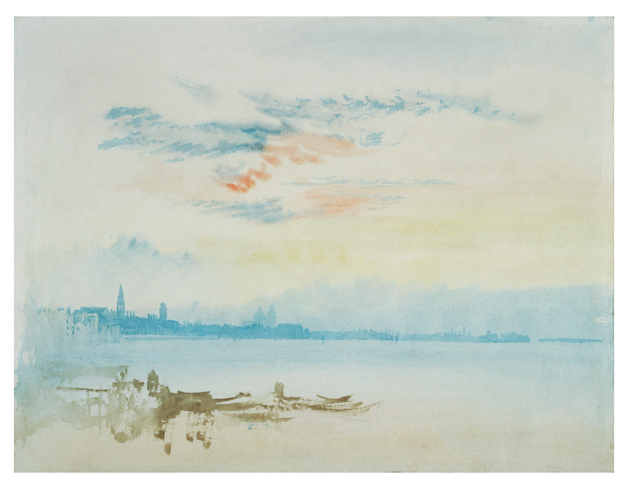
Section 4: Drawing, printing, photography, collage and film

Joseph Mallord William Turner, Venice: Looking East towards San Pietro di Castello – Early Morning , 1819, (watercolour on paper), (223 mm × 287 mm), (Tate)