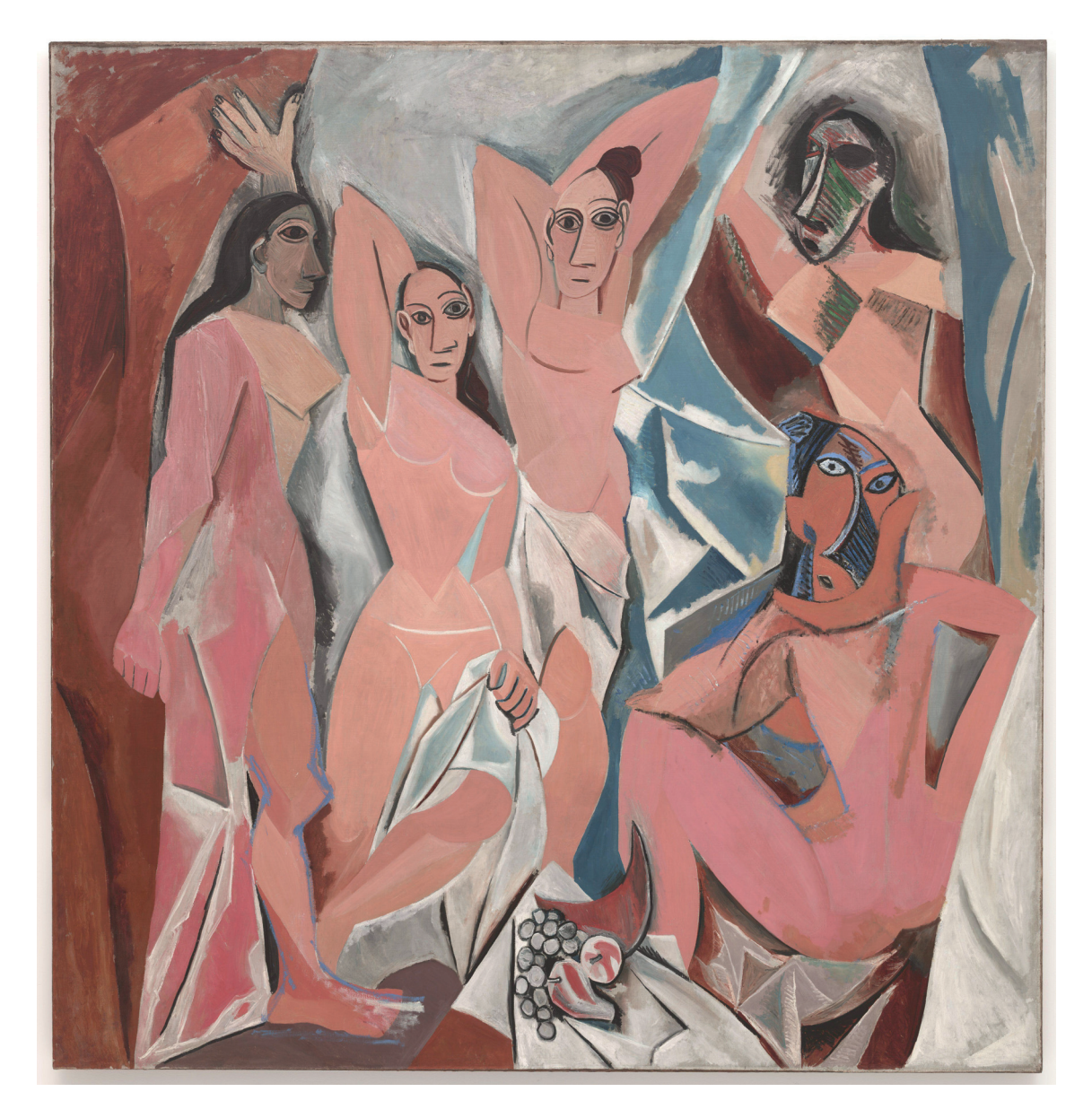
Pablo Picasso, Les Demoiselles d'Avignon , 1907, (oil on canvas), (244 cm × 234 cm), (Museum of Modern Art, New York)