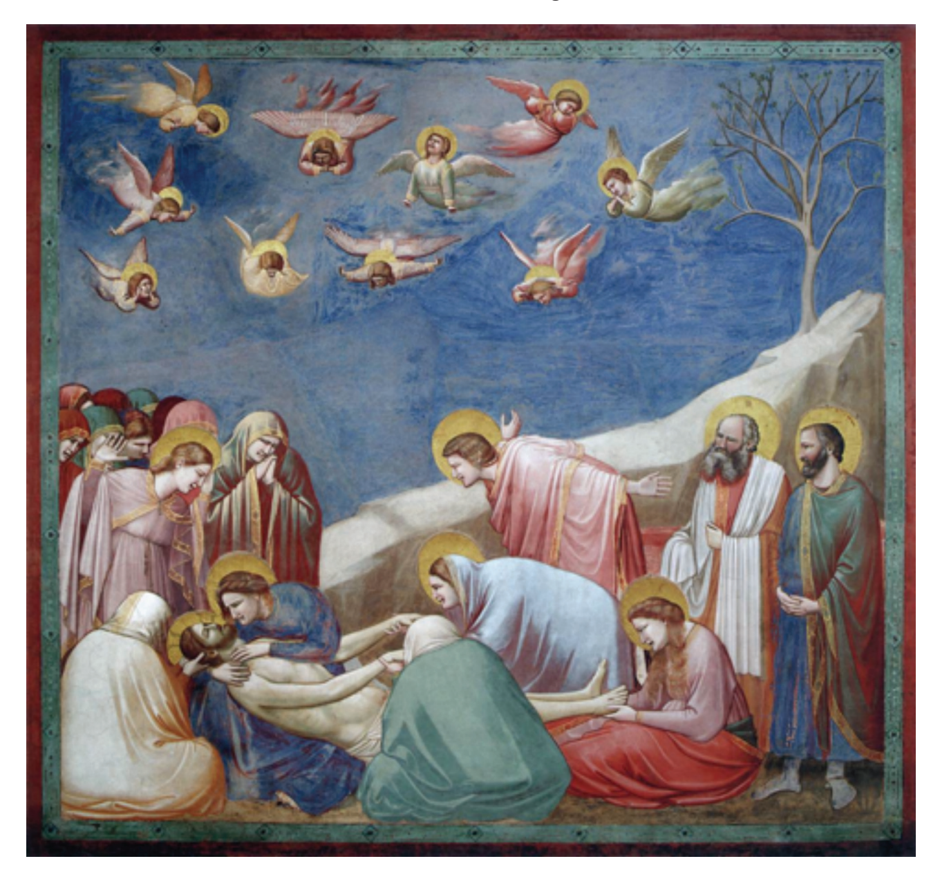
Giotto, Lamentation , c.1304–13, (fresco), (185 × 200 cm) (Scrovegni Chapel, Padua)

1 (a) Analyse the composition of Giotto's Lamentation. [10]