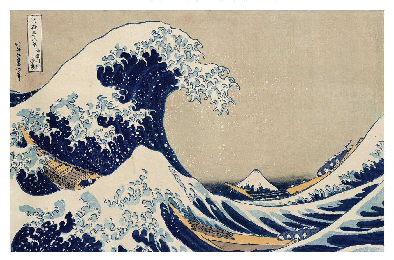
Section 4: Drawing, printing, photography, collage and film

Hokusai, The Great Wave off Kanagawa , c.1829–33, (Polychrome woodblock print; ink and colour on paper), (26 × 38 cm), (The Metropolitan Museum of Art, New York)