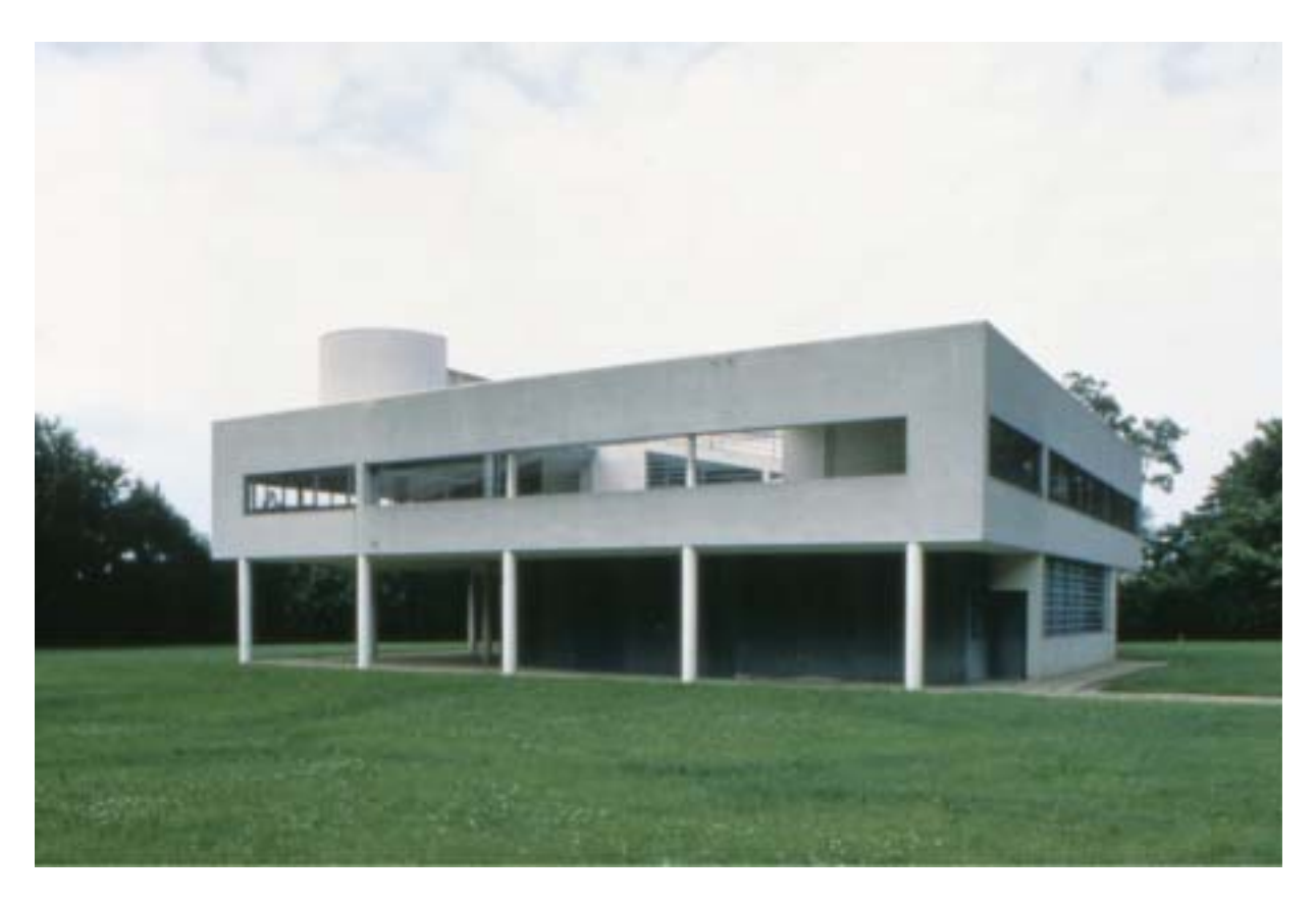
Le Corbusier, Villa Savoye, Poissy-sur-Seine, 1929