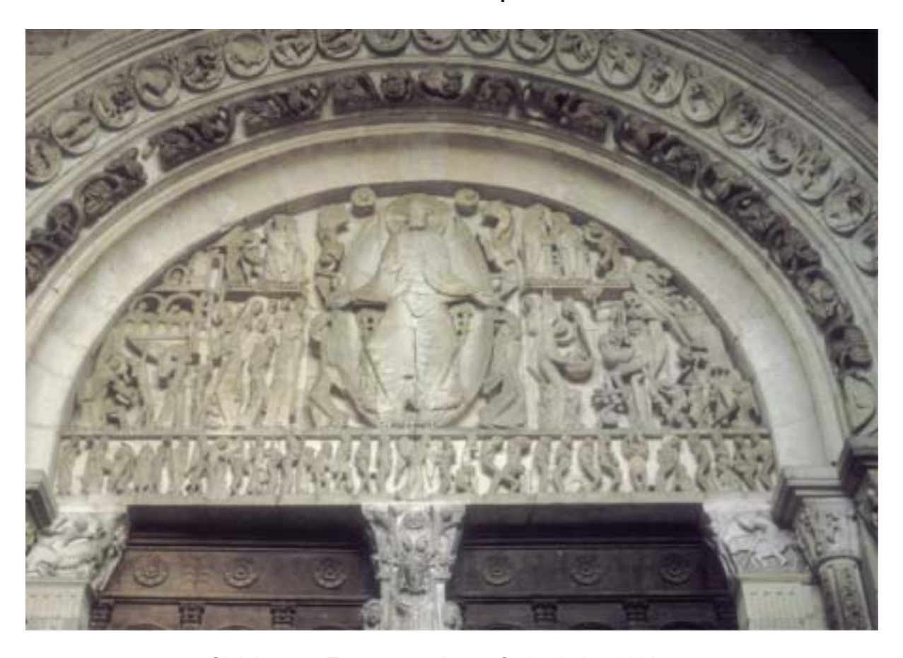
Section 2: Sculpture

Gislebertus, Tympanum , Autun Cathedral, c.1130–45