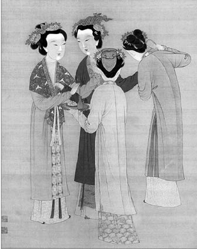
'Four Beauties', a Ming Dynasty painting

Extract adapted from an article on an English-language website sponsored by the Chinese Ministry of Culture