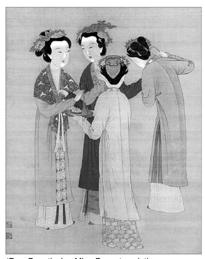
'Four Beauties', a Ming Dynasty painting

Extract adapted from an article on an English-language website sponsored by the Chinese Ministry of Culture