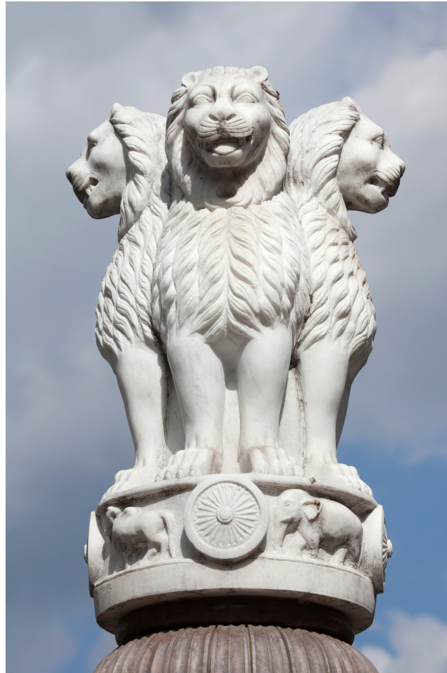
Bengal before 1100 AD

Ashoka from Sarnath erected in front of the India House at Budapest Zoo in Budapest, Hungary